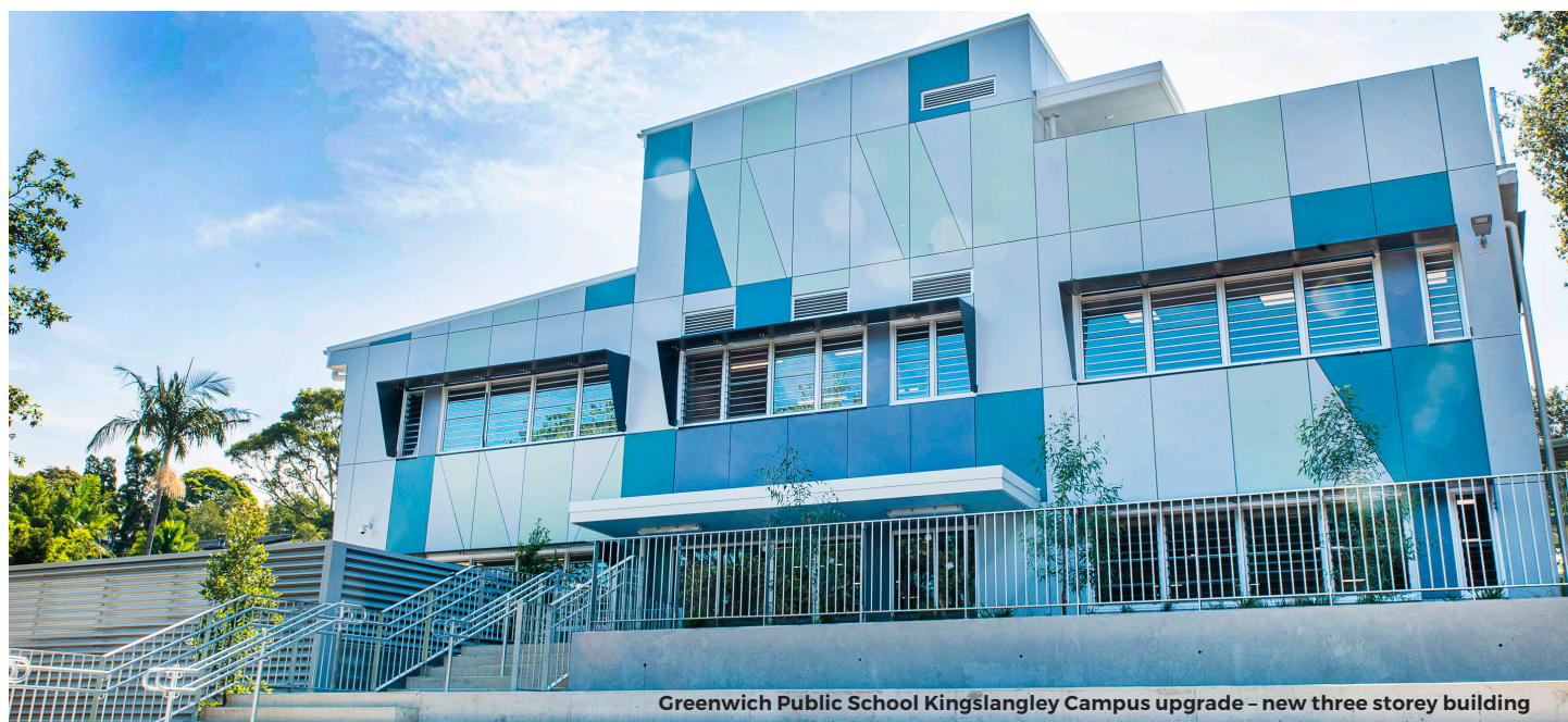
Greenwich Public School Kingslangley Campus upgrade – new three storey building