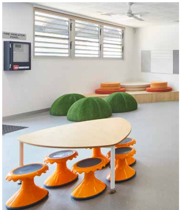
Innovative learning spaces