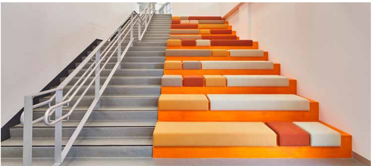
Innovative learning spaces