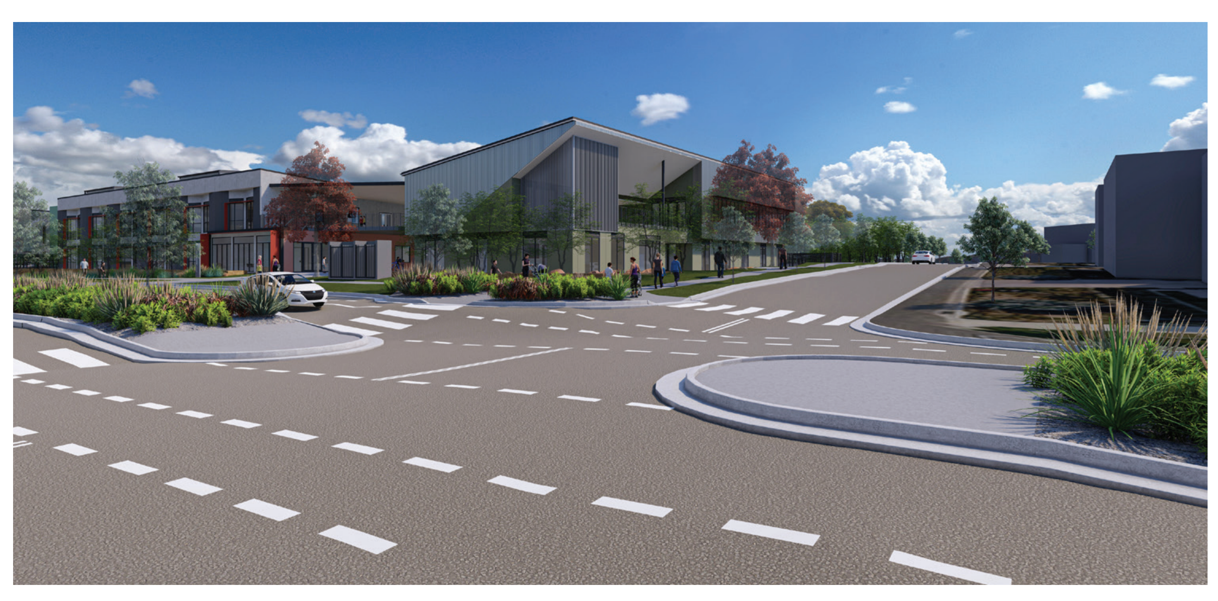
Artist impressions of the new primary school in Googong. Indicative only.