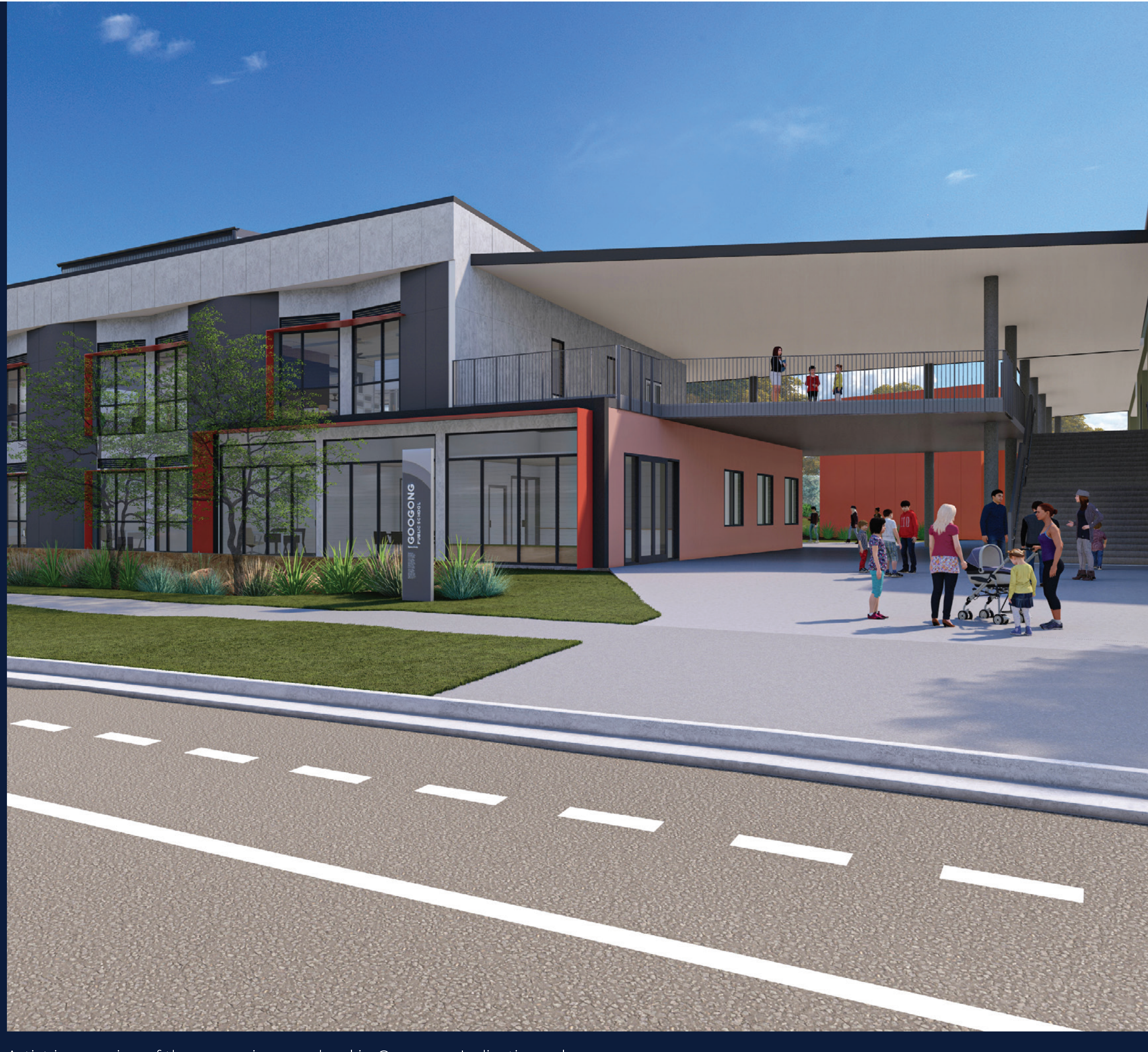
Artist impression of the new primary school in Googong. Indicative only.