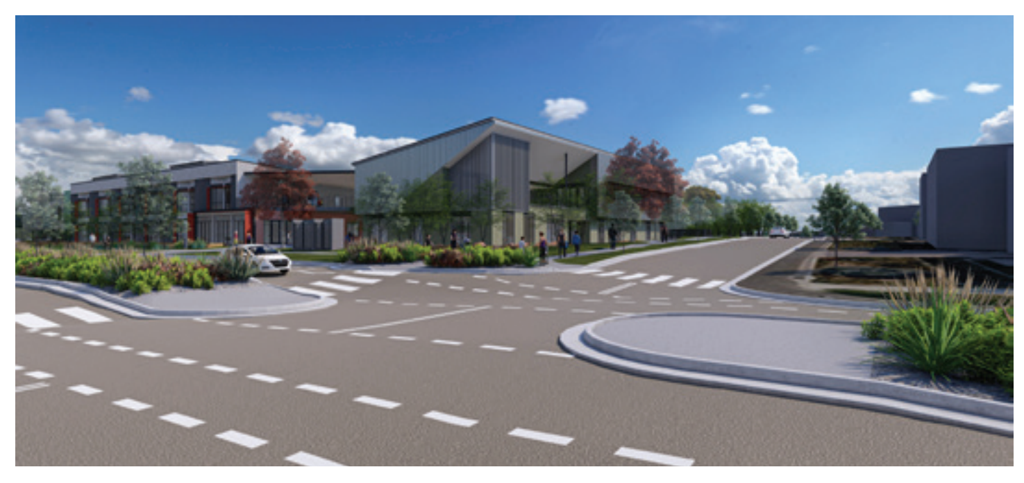
Artist impressions of the new primary school in Googong. Indicative only.