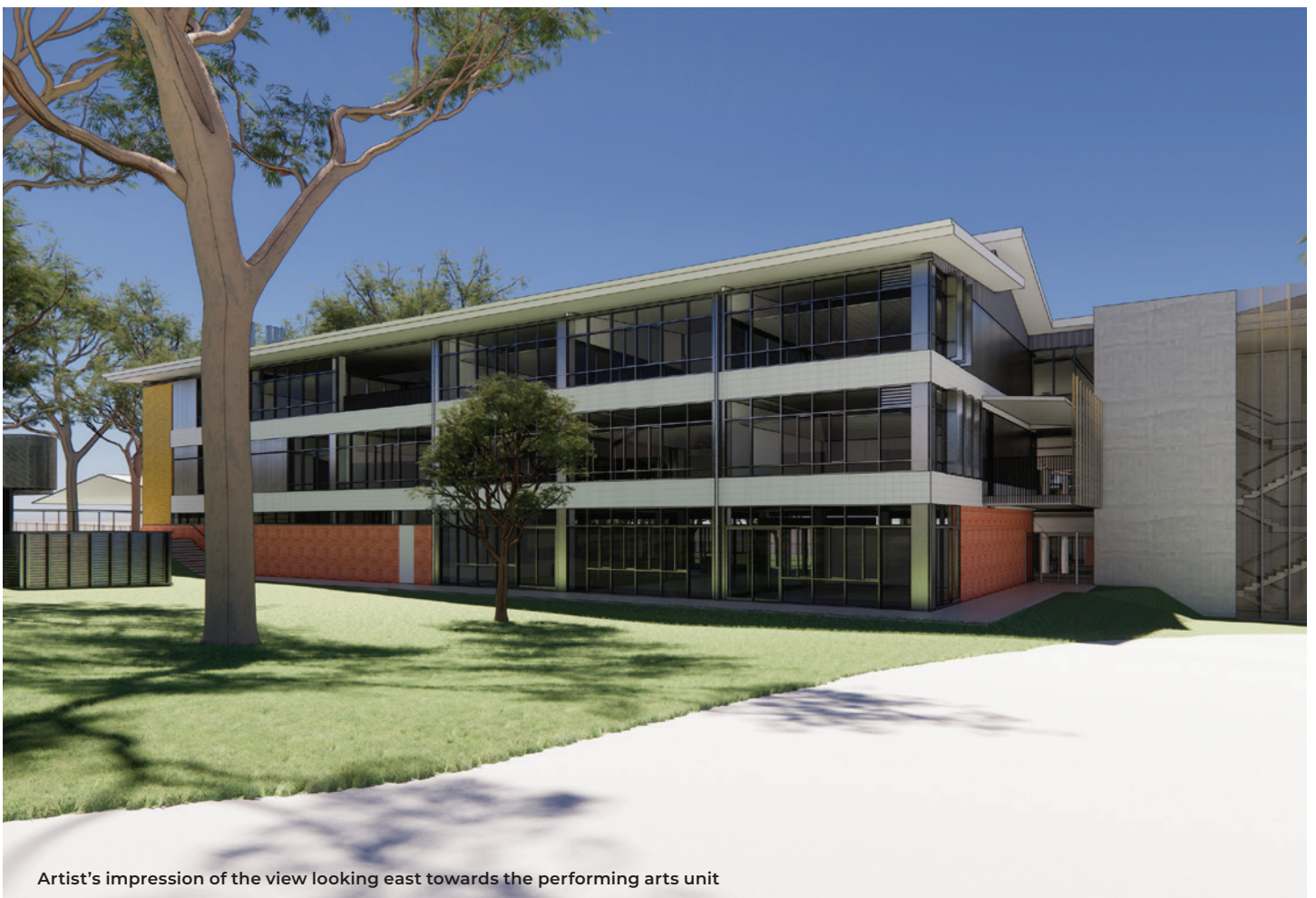
Artist's impression of the view looking east towards the performing arts unit

Noise and dust control measures will be implemented following planning approval requirements. Hoarding, secure fencing and shade cloth will be erected to reduce noise and dust impacts on the school and residents. Dust from construction works will be hosed down as required.