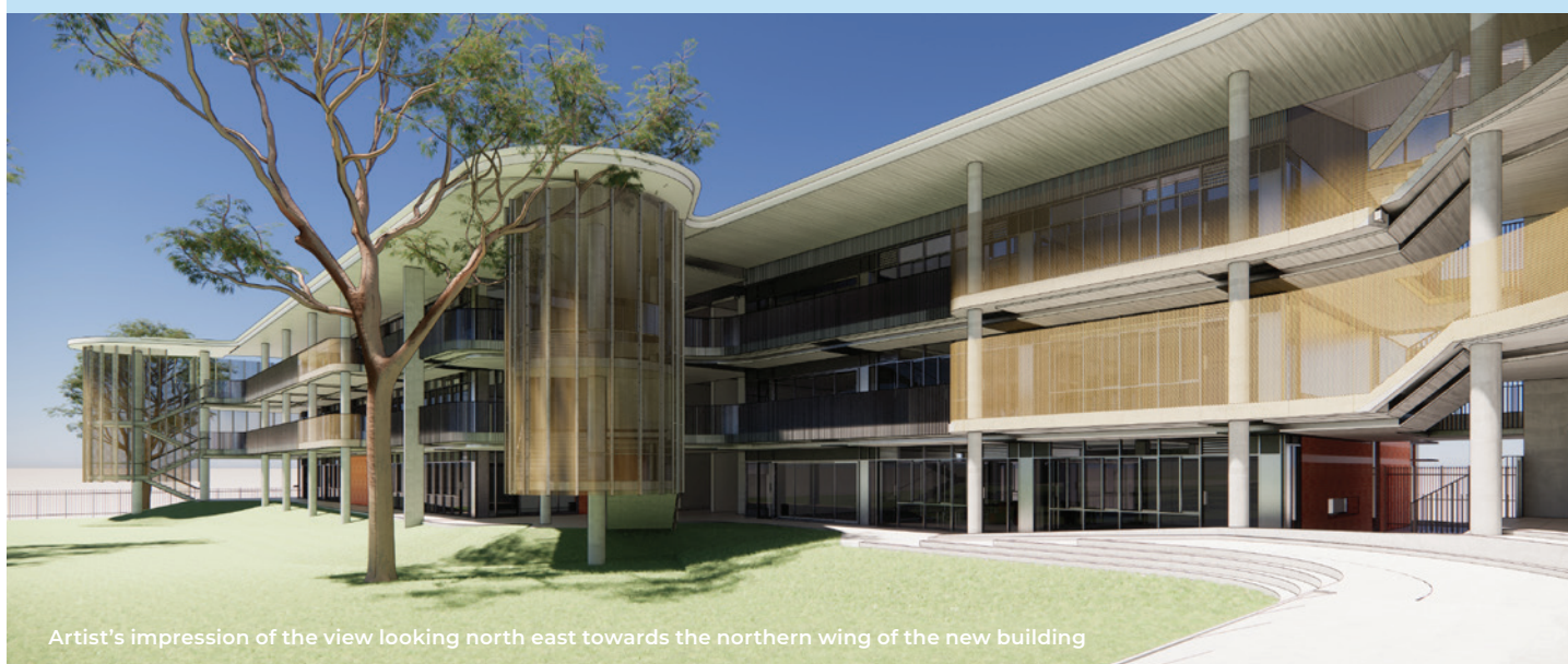
Artist's impression of the view looking north east towards the northern wing of the new building

The NSW Government is investing $7.9 billion over the next four years, continuing its program to deliver 215 new and upgraded schools to support communities across NSW. This is the largest investment in public education infrastructure in the history of NSW.