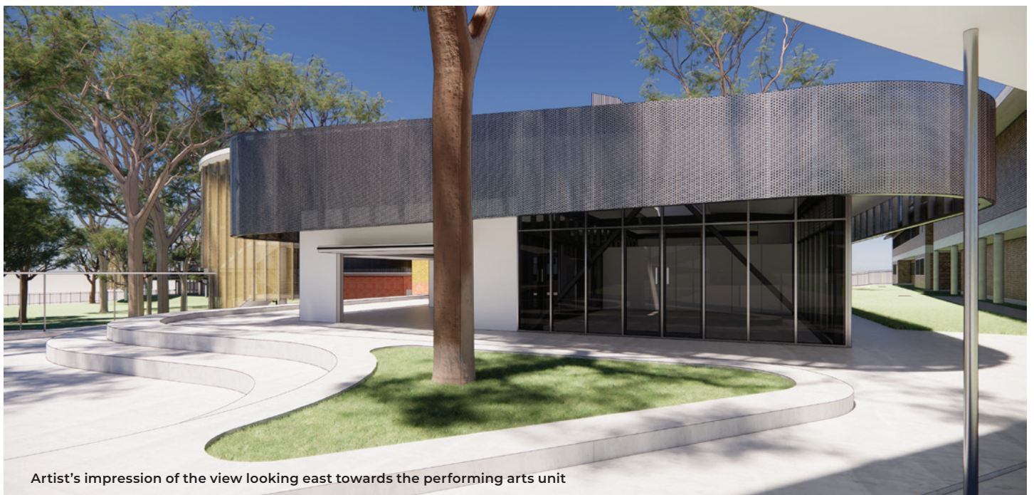
Artist's impression of the view looking east towards the performing arts unit