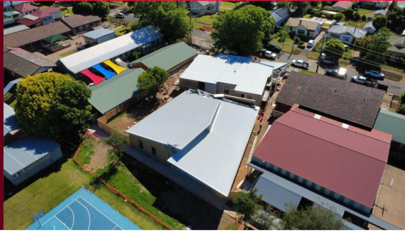
Image caption: Aerial view of new library and administration buildings