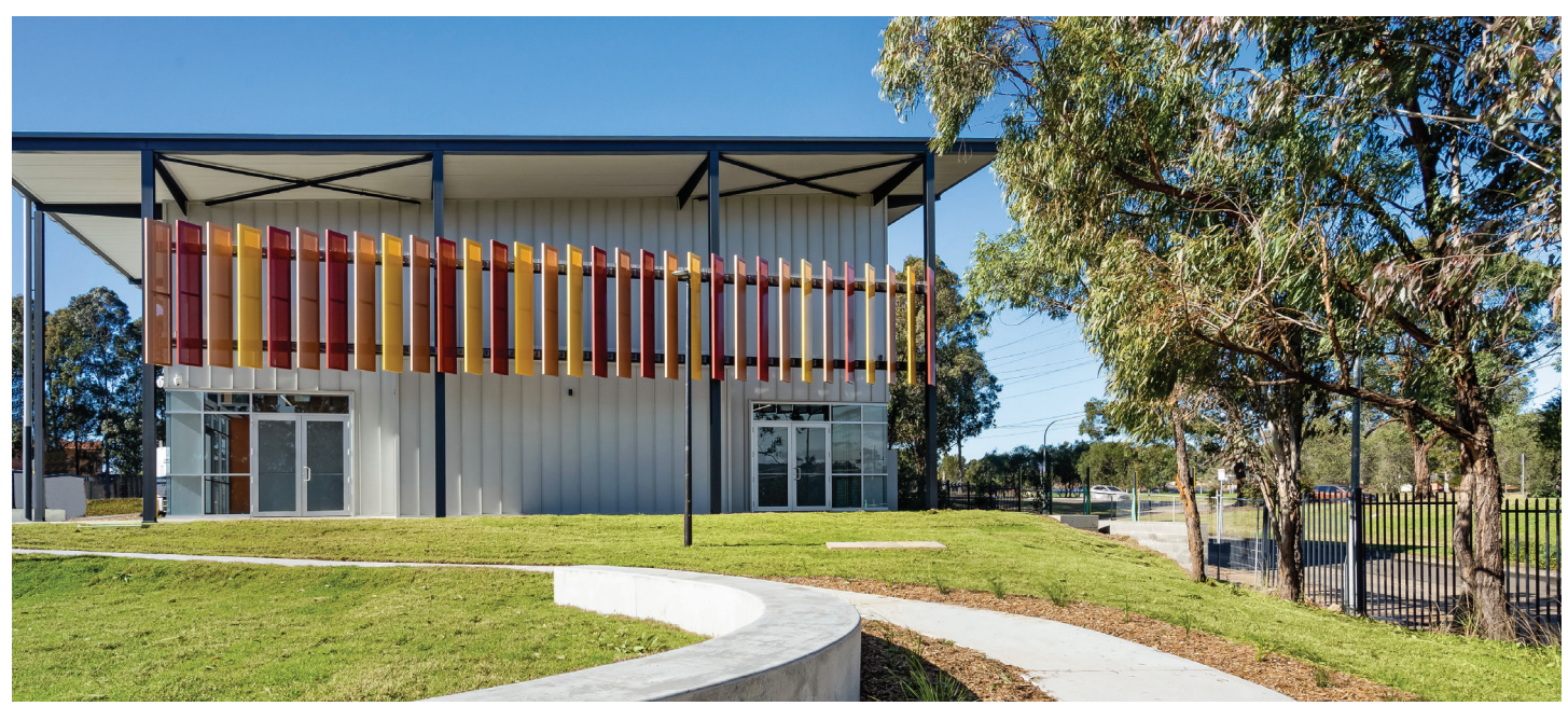
External view of new performing arts and learning centre