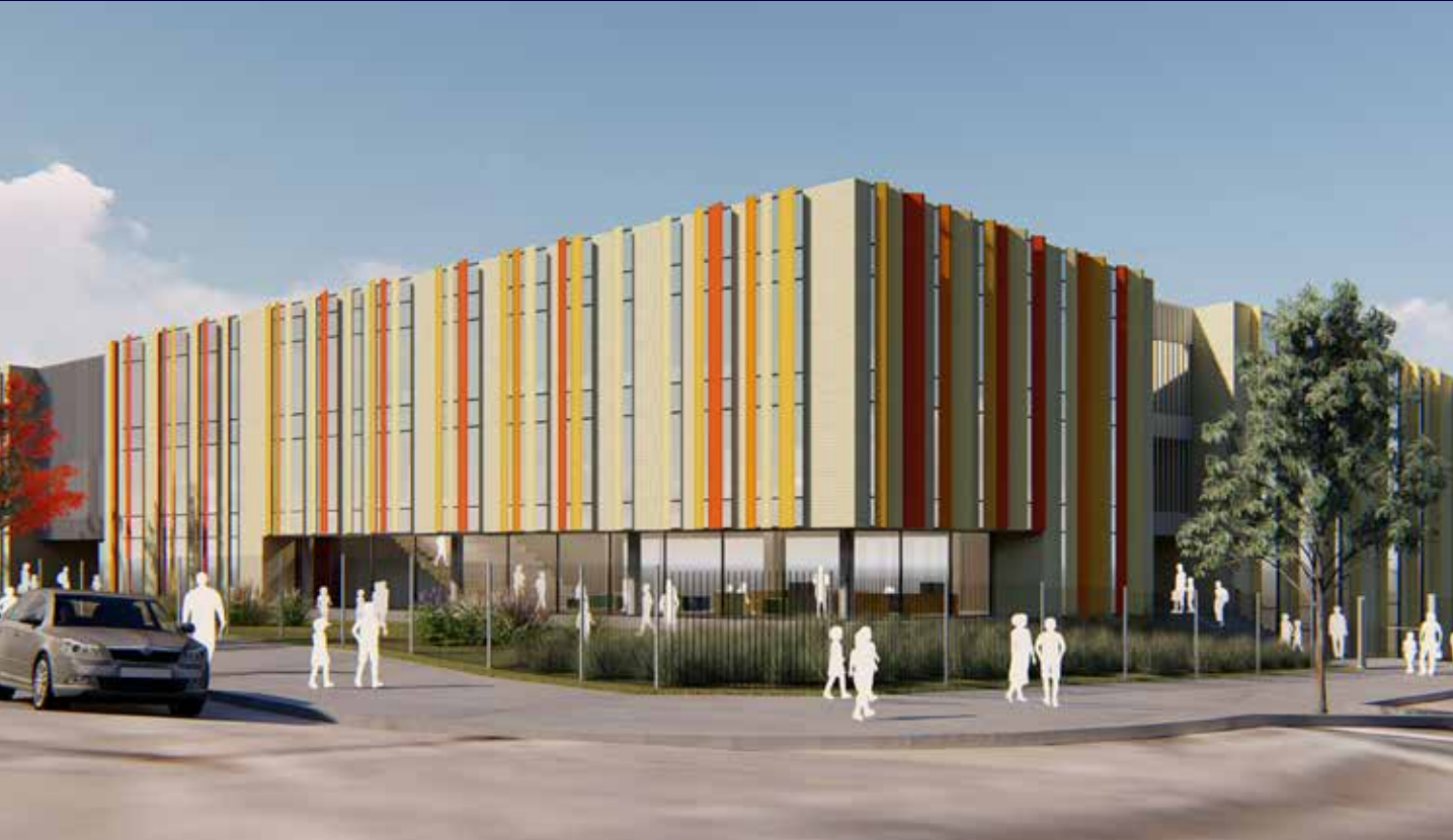
Artist impression of Gledswood Hills new primary school