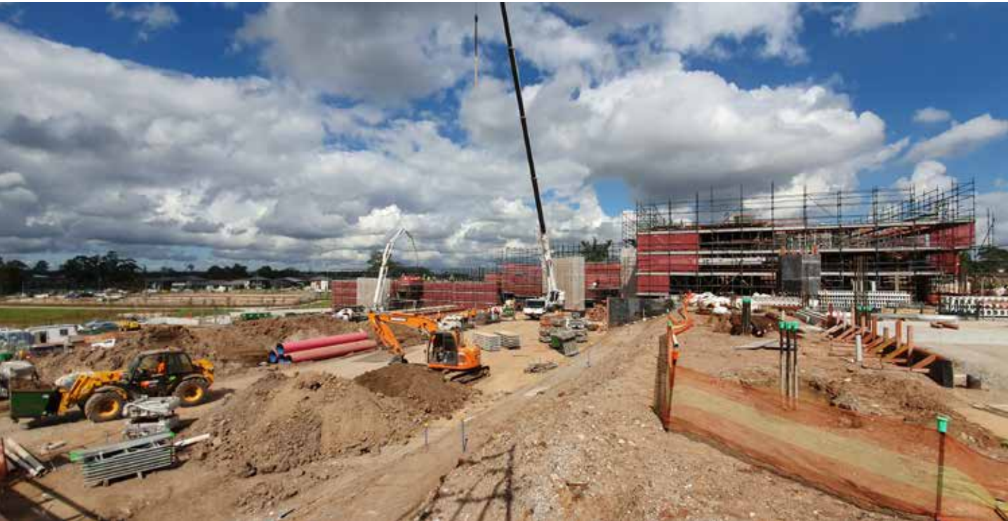
Gledswood Hills new primary school is under construction