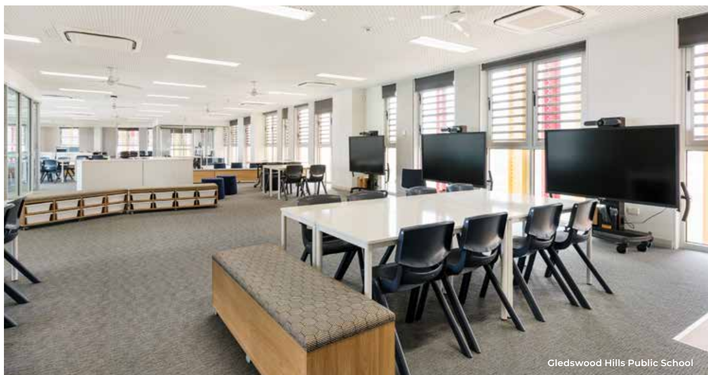
Gledswood Hills Public School