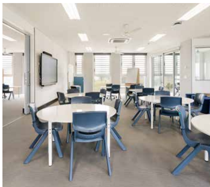
Innovative learning spaces

Students, parents and teachers will make their way to the multi-purpose court. Teachers will greet the students and lead them into our new learning spaces.