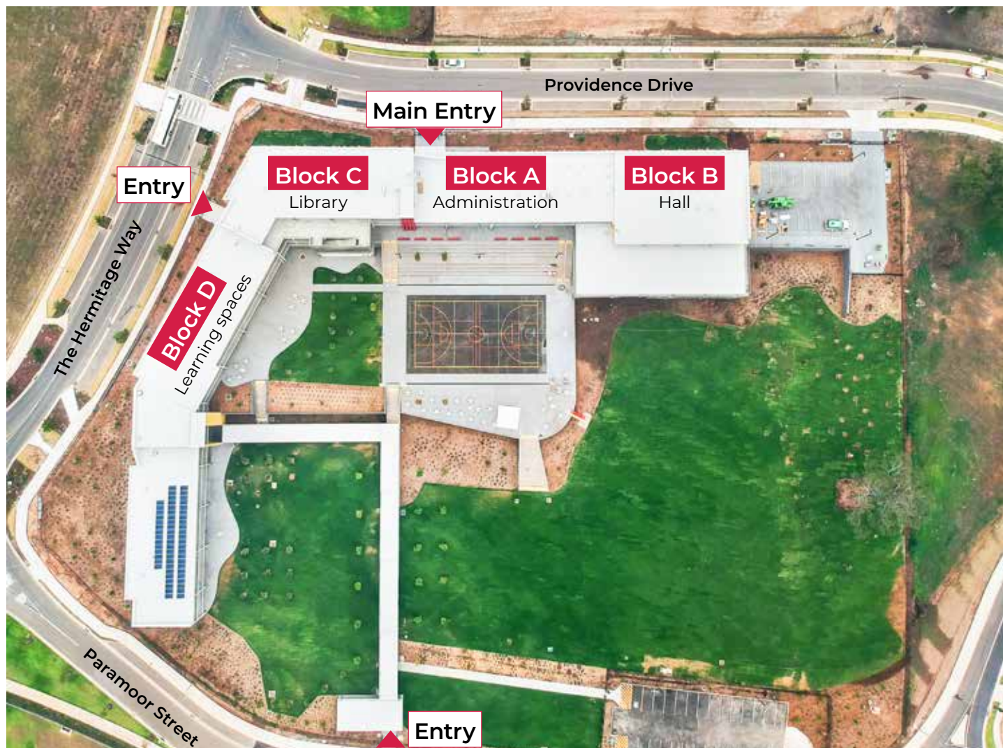
Map of Gledswood Hills Public School