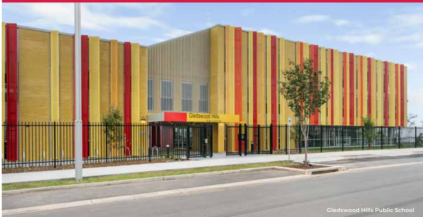
Gledswood Hills Public School