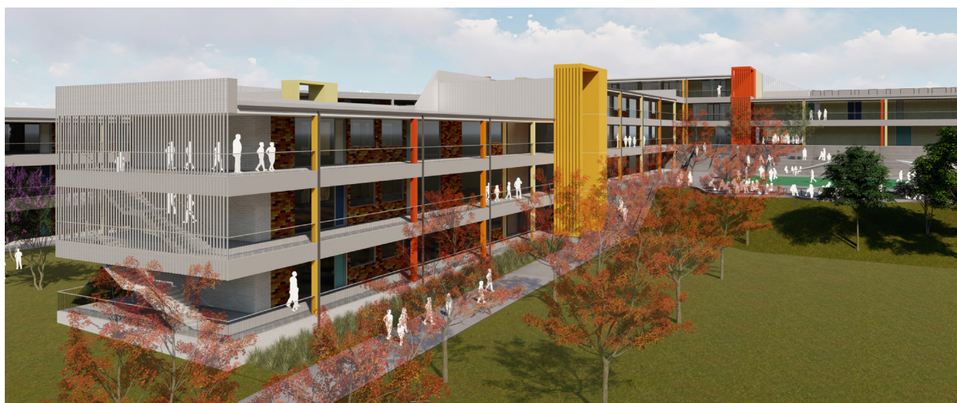
An artist impression of Stage 2 of the new Gledswood Hills Public School