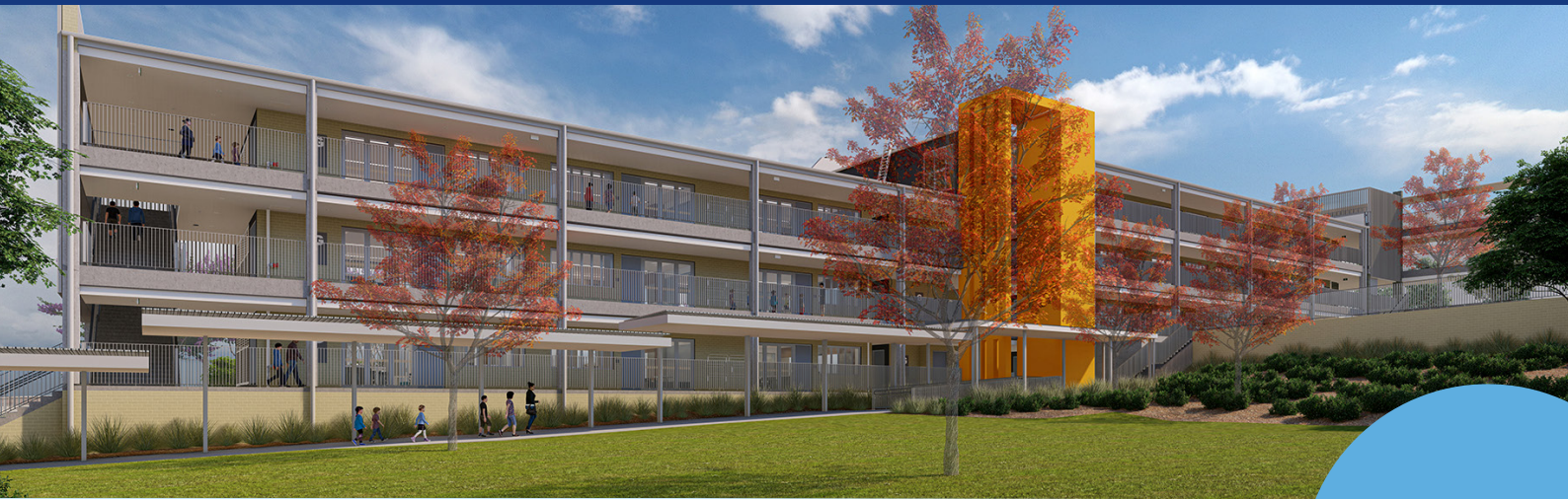
Gledswood Hills Public School opened January 2020