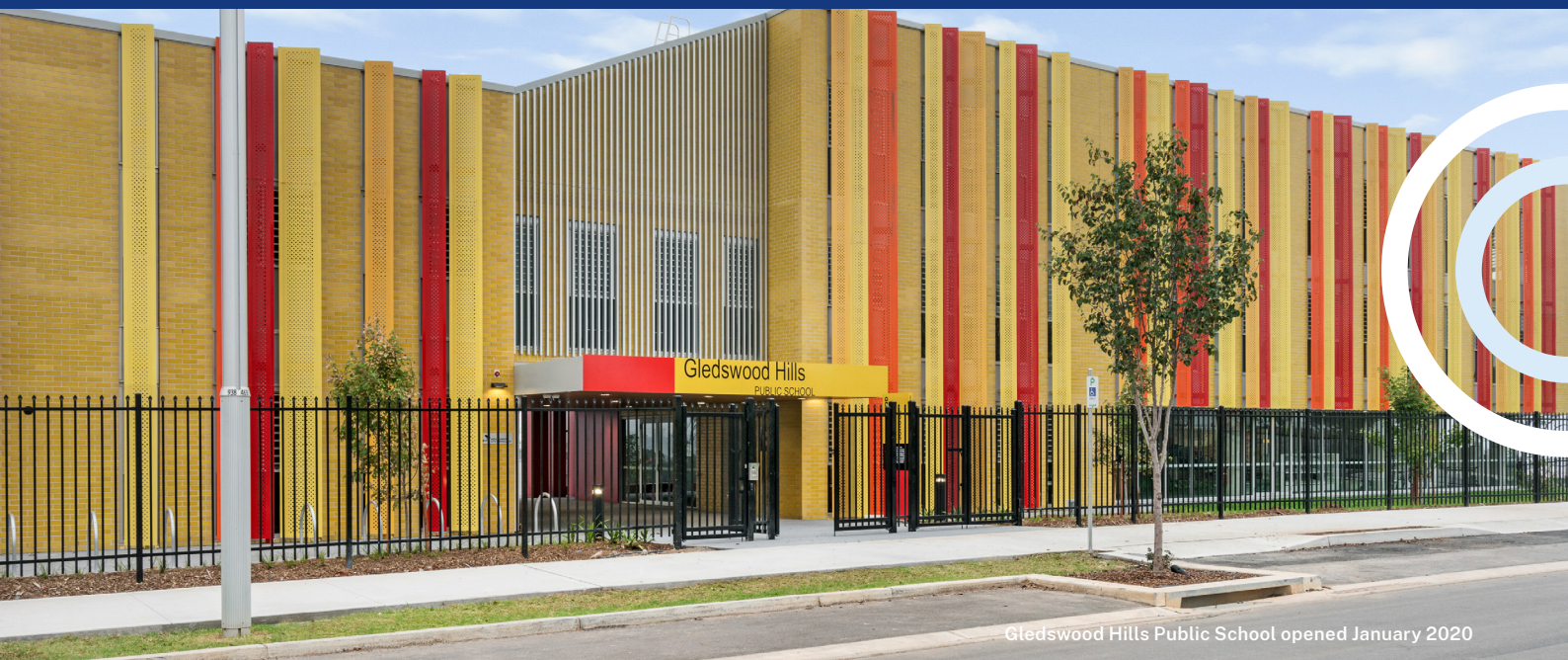
Gledswood Hills Public School opened January 2020