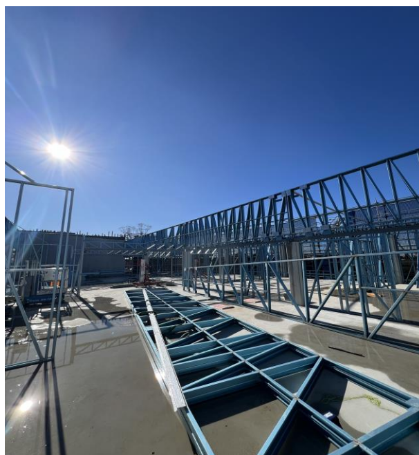
Structural steel installation