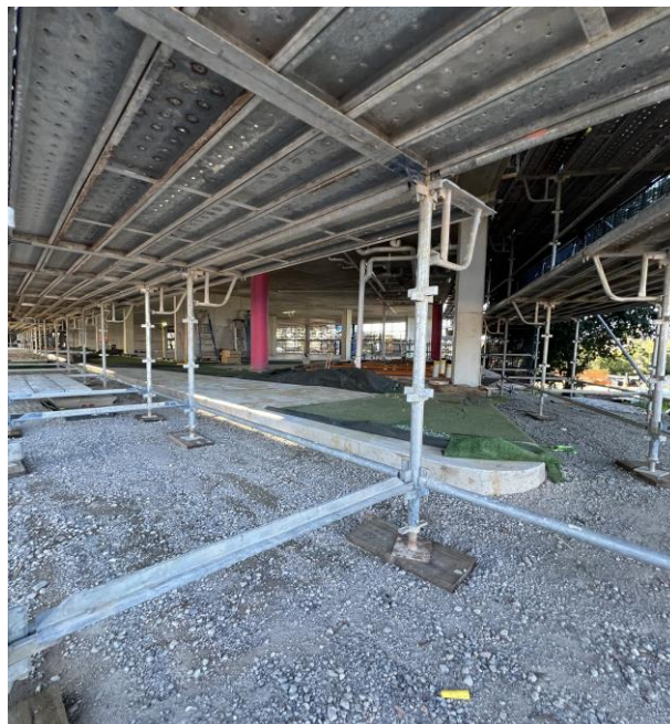
View from the ground level of Building O