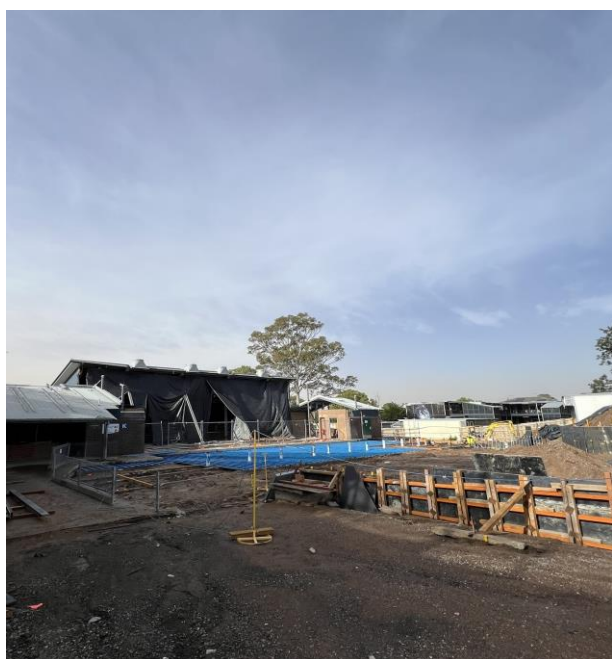
View of the hall and COLA extension