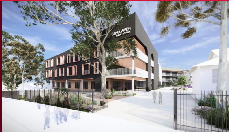
Image caption: Artist impression of Girraween Public School upgrade