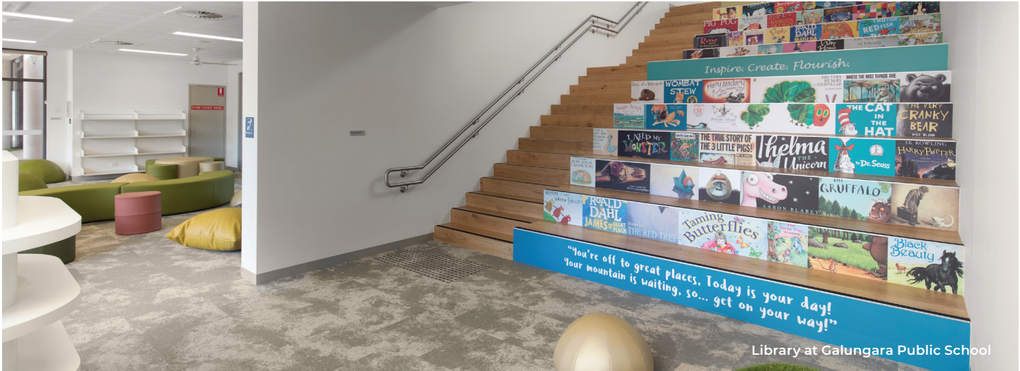
Library at Galungara Public School