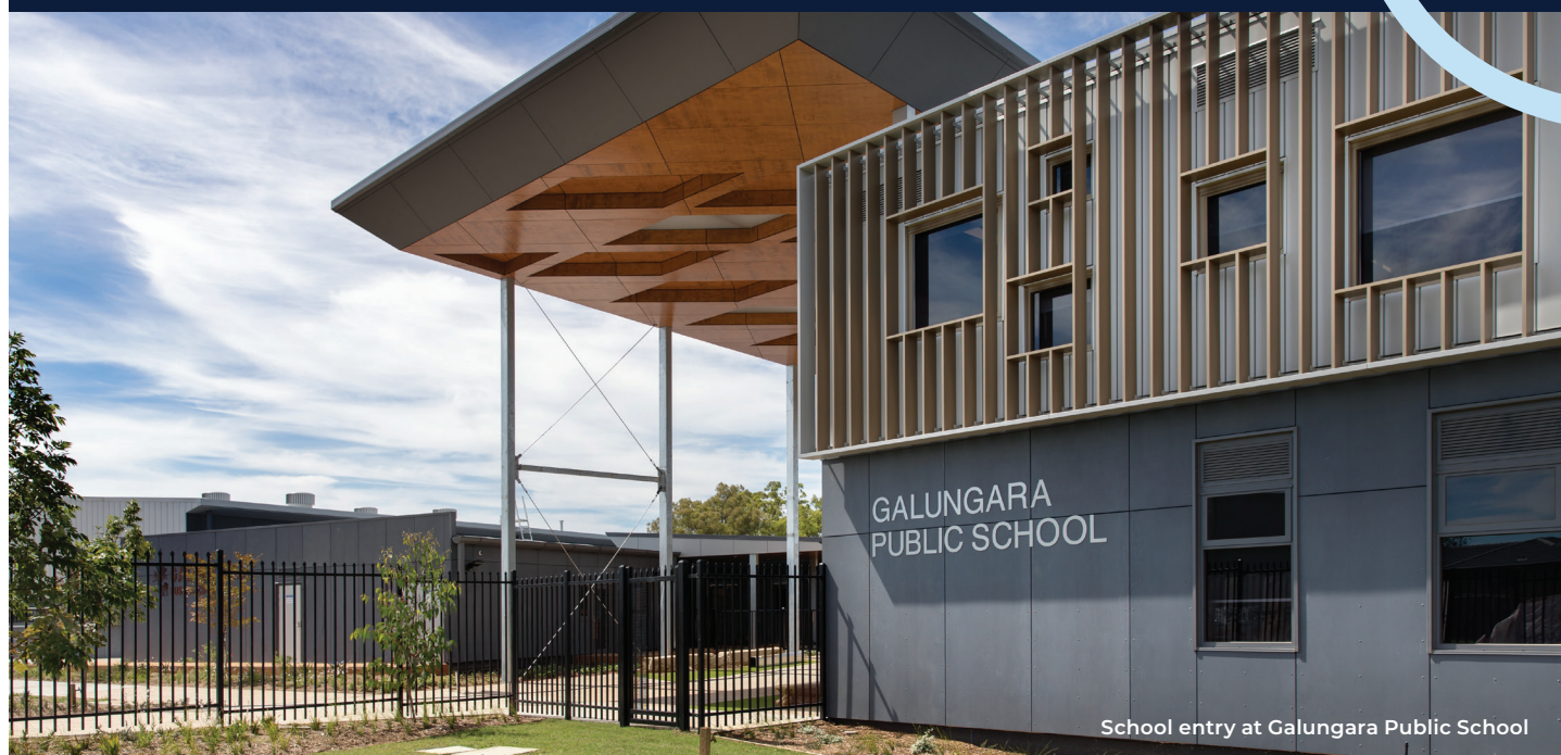
School entry at Galungara Public School