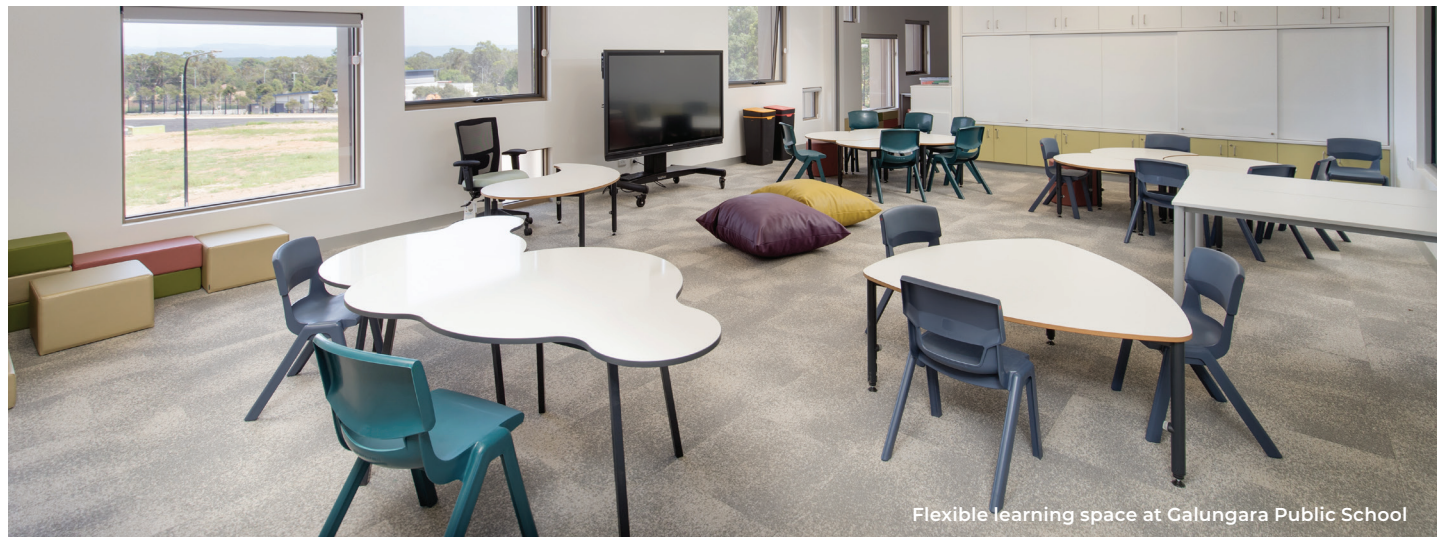
Flexible learning space at Galungara Public School