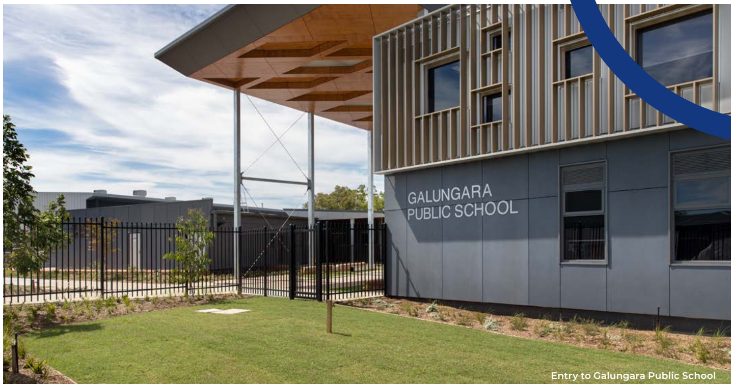
Entry to Galungara Public School