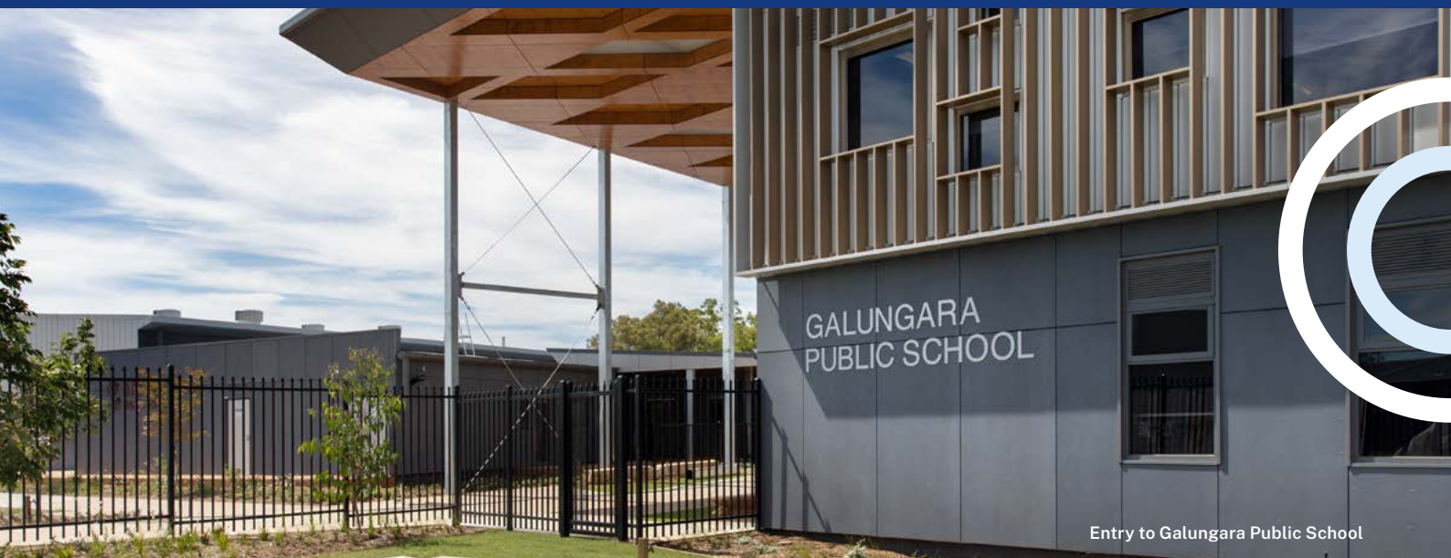
Entry to Galungara Public School