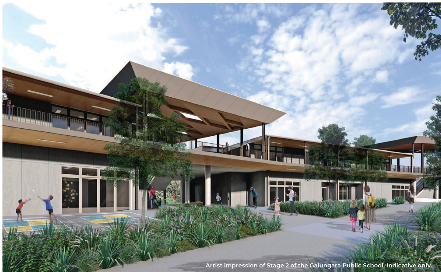
Artist impression of Stage 2 of the Galungara Public School. Indicative only.