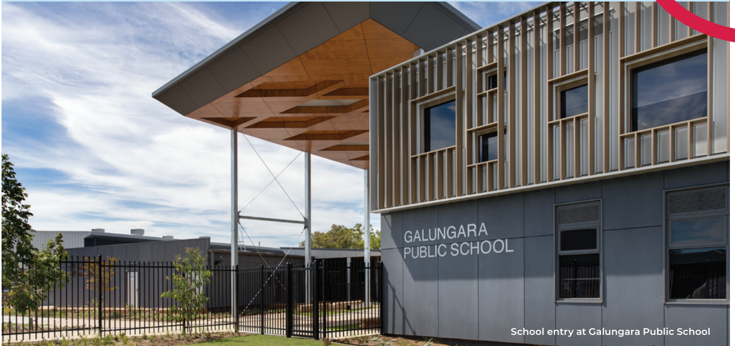
School entry at Galungara Public School

The NSW Government is investing $7.9 billion over the next four years, continuing its program to deliver 215 new and upgraded schools to support communities across NSW. This is the largest investment in public education infrastructure in the history of NSW.