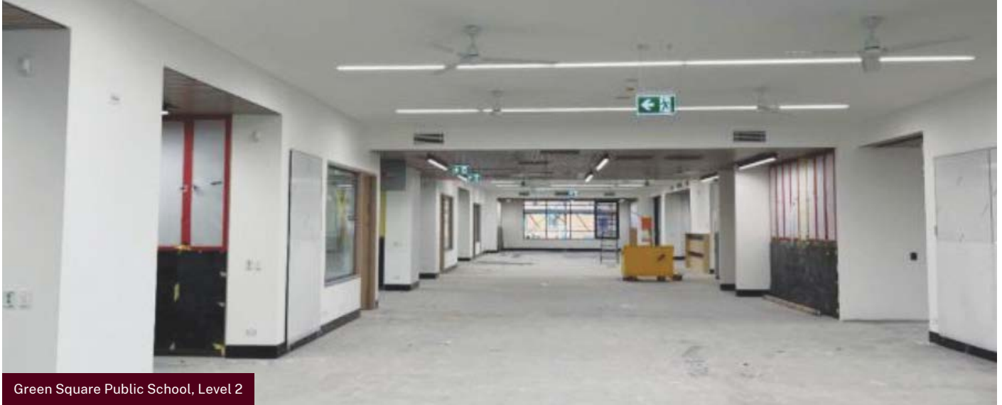
Green Square Public School, Level 2