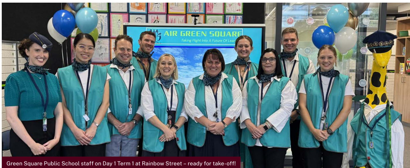
Green Square Public School staff on Day 1 Term 1 at Rainbow Street – ready for take-off!