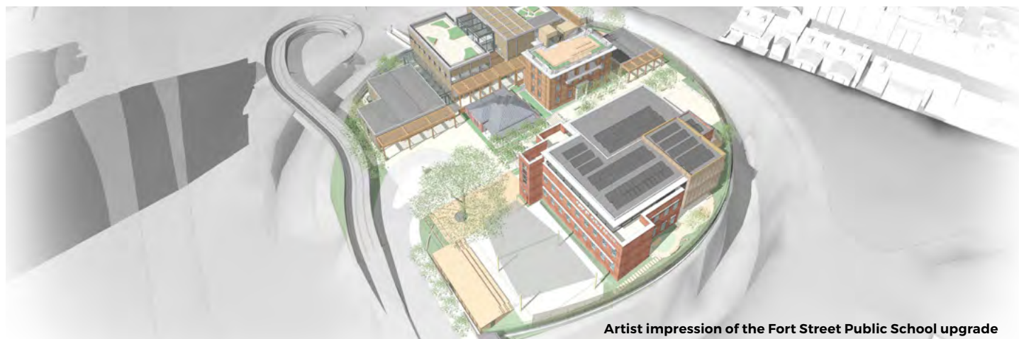
Artist impression of the Fort Street Public School upgrade