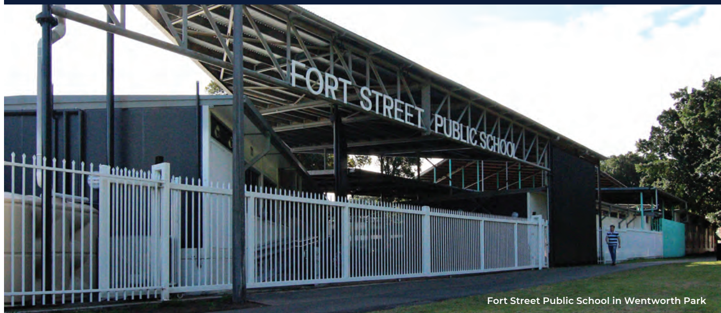
Fort Street Public School in Wentworth Park

The NSW Government is investing $6.7 billion over four years to deliver more than 190 new and upgraded schools to support communities across NSW. This is the largest investment in public education infrastructure in the history of NSW.