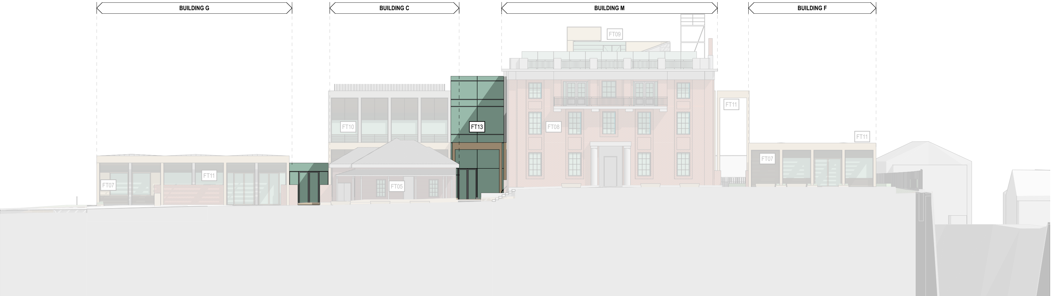
NORTH ELEVATION (CENTRAL PLAZA)

The verticality and materiality of the exposed concrete frames ensures it retains cohesion with the other new additions to the southern part of the campus.