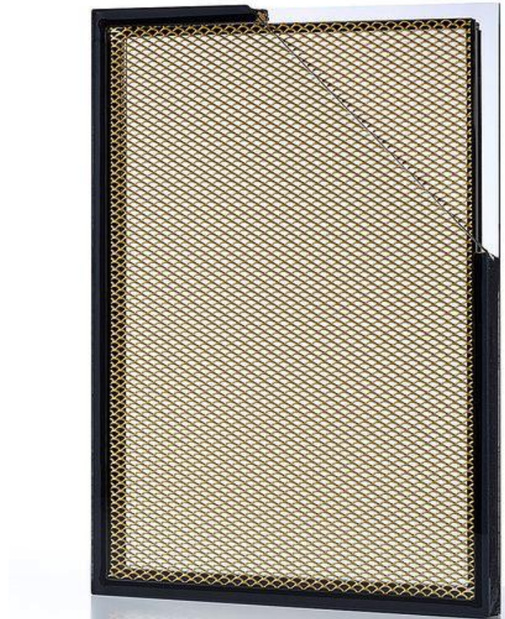
FACADE TYPE EXTENT