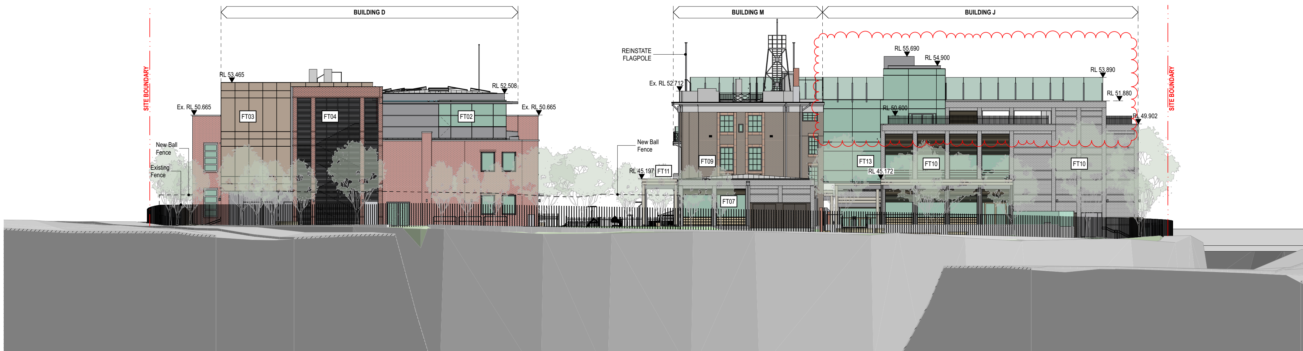
2 ELEVATION WEST 1:200