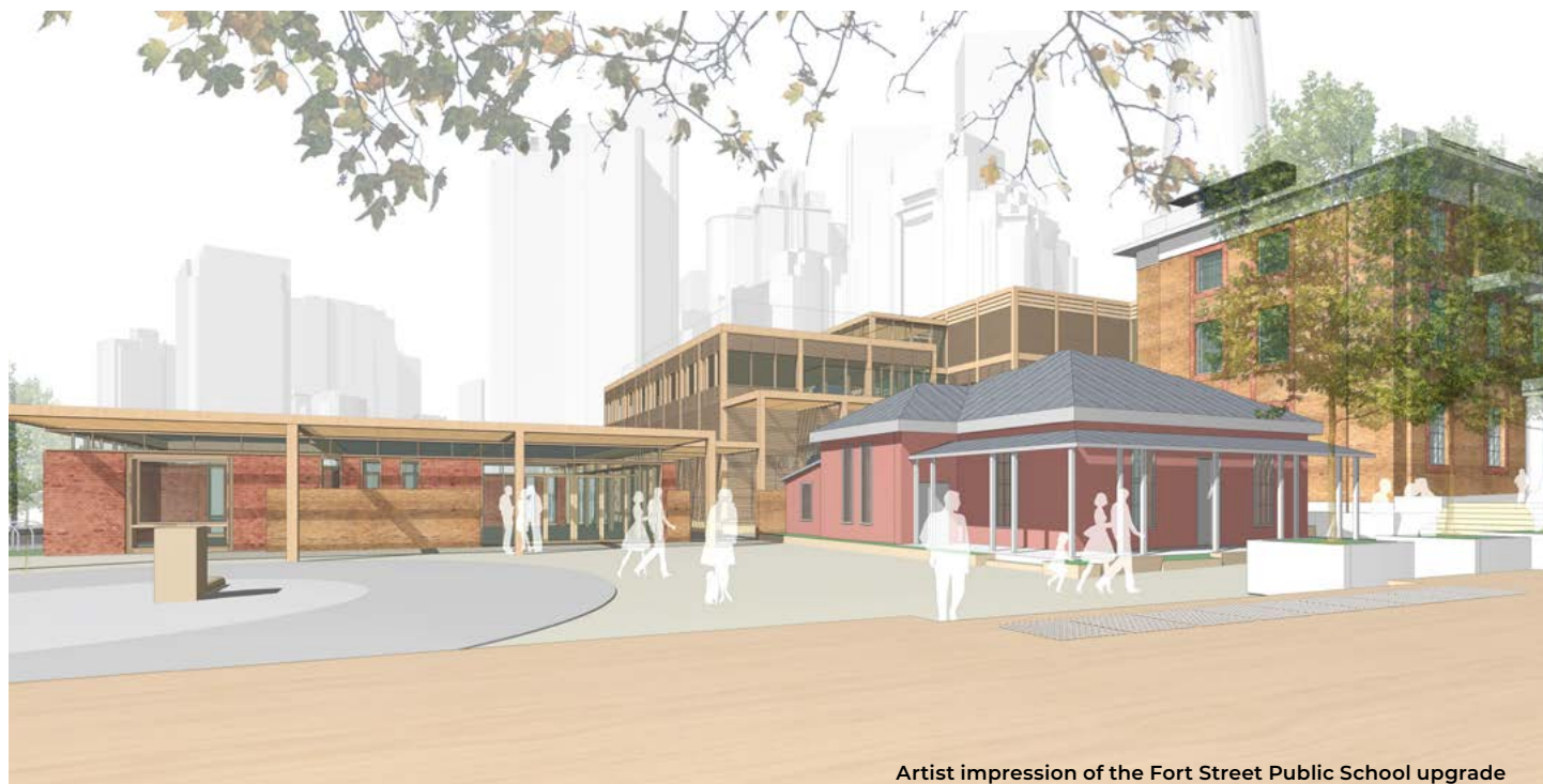
Artist impression of the Fort Street Public School upgrade