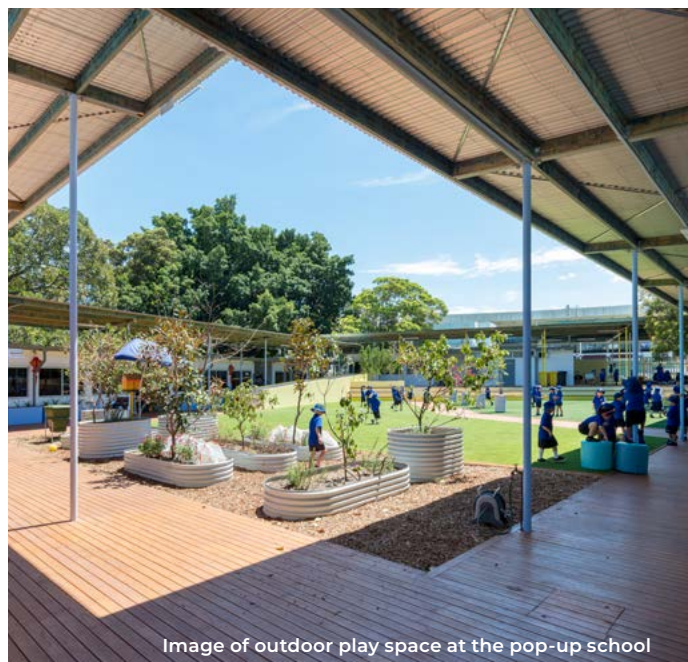
Image of outdoor play space at the pop-up school