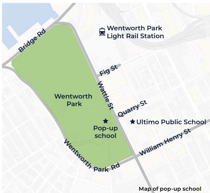
Map of pop-up school