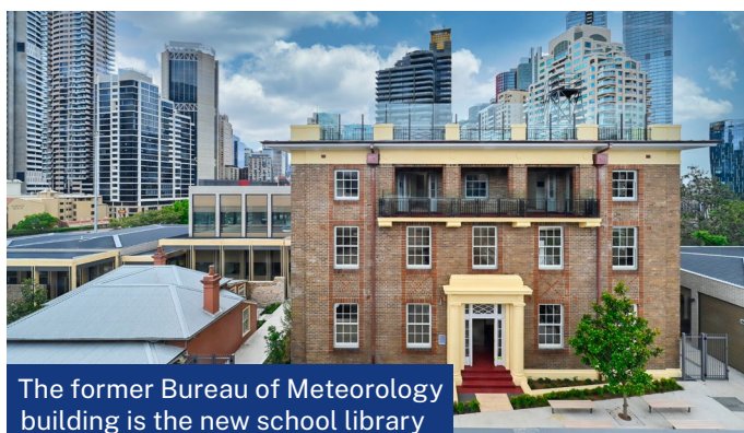
The former Bureau of Meteorology building is the new school library