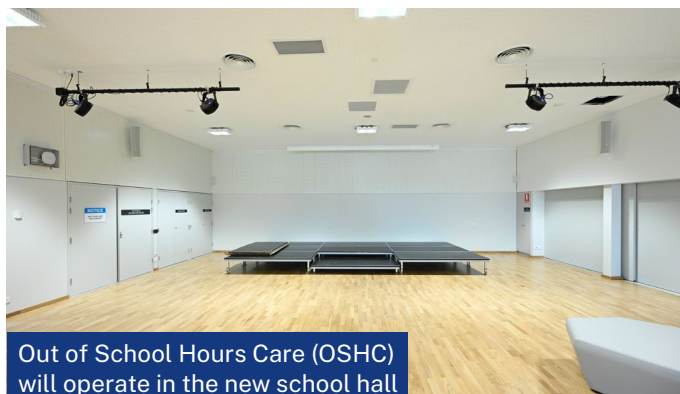
Out of School Hours Care (OSHC) will operate in the new school hall