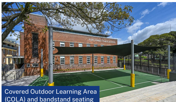
Covered Outdoor Learning Area (COLA) and bandstand seating