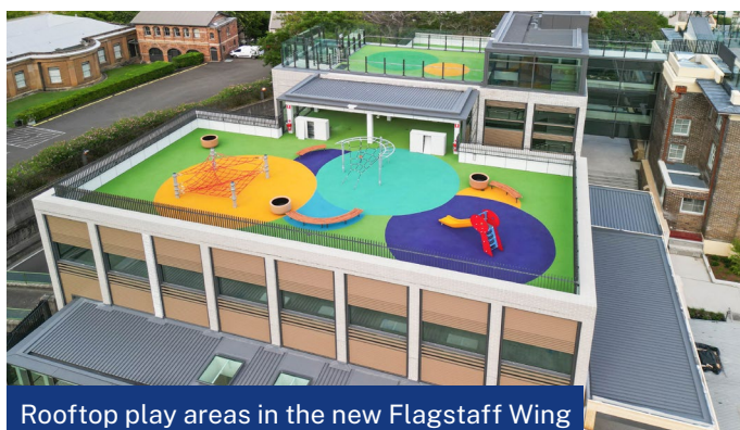
Rooftop play areas in the new Flagstaff Wing