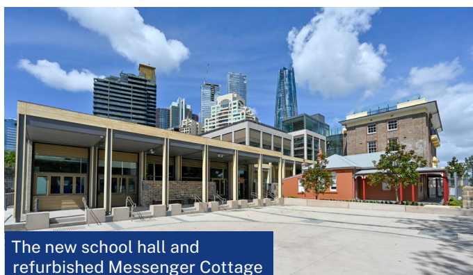
The new school hall and refurbished Messenger Cottage