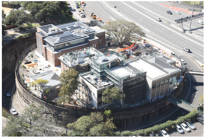
Fort Street Public School September 2023

The shared pathway diversion will remain in place until late November 2023 when new permanent public access will be opened.