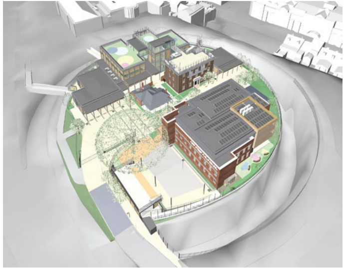
Aerial view artistic render of the new Fort Street Public School site

There will be a new addition to the north (Building D), which will include a COLA at ground level and a learning space on the second level.