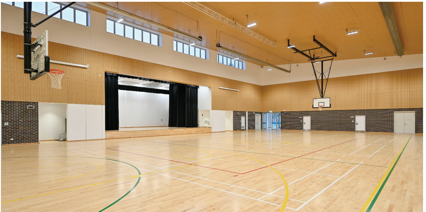
Block J multipurpose hall