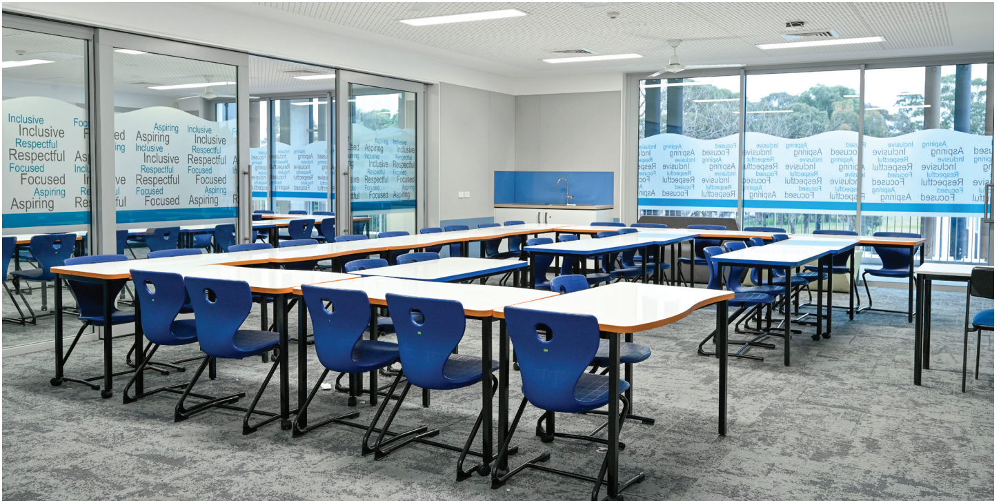
Flexible learning space in Block K