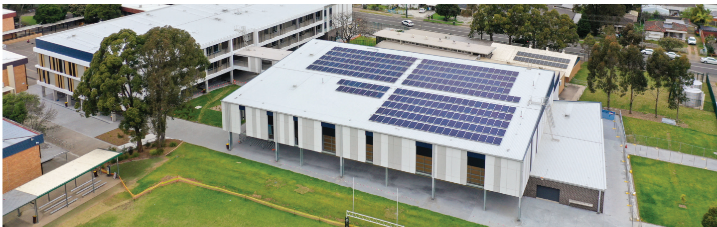
284 solar panels installed on Block K