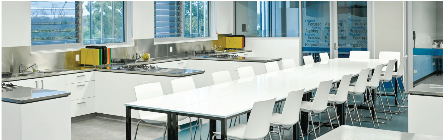
New food technology facilities in Block K