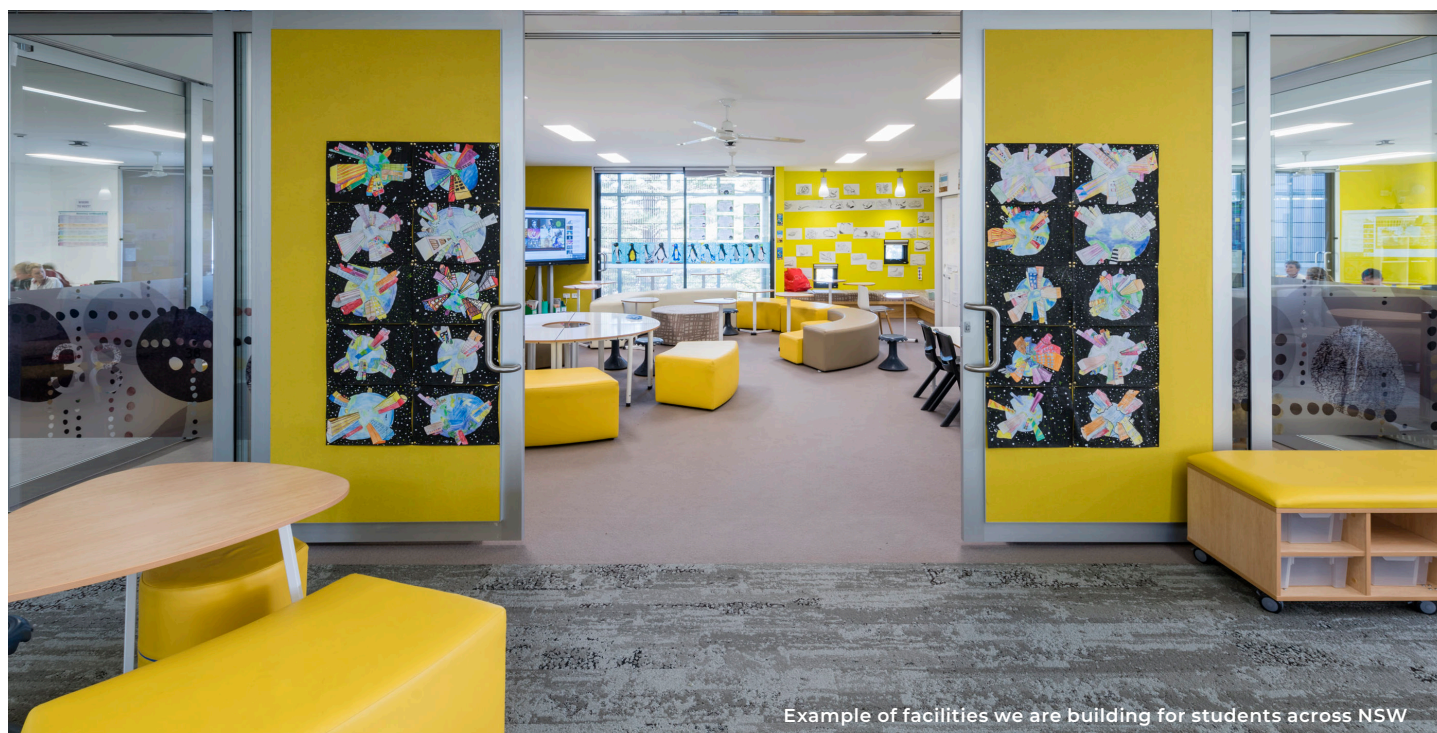
Example of facilities we are building for students across NSW