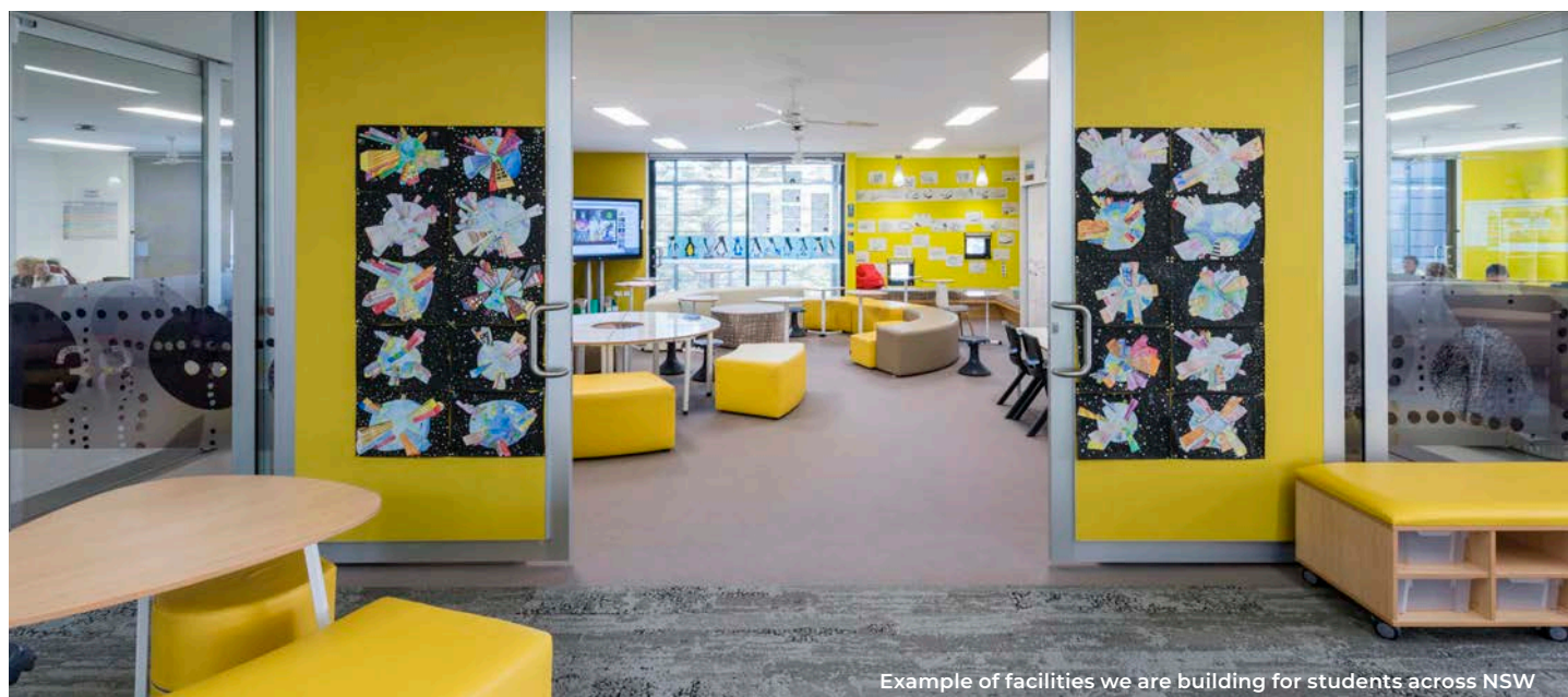
Example of facilities we are building for students across NSW