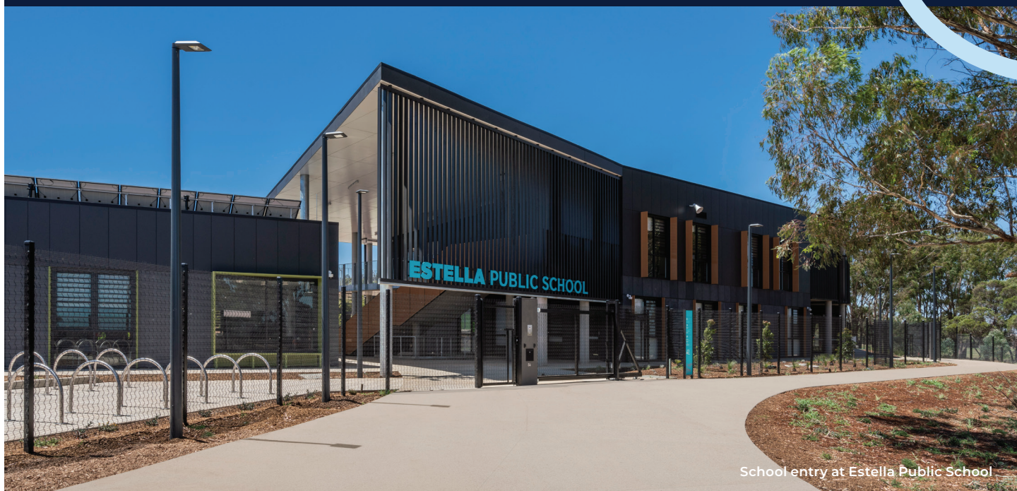
School entry at Estella Public School