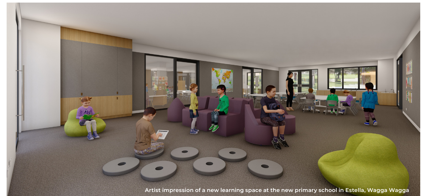
Artist impression of a new learning space at the new primary school in Estella, Wagga Wagga