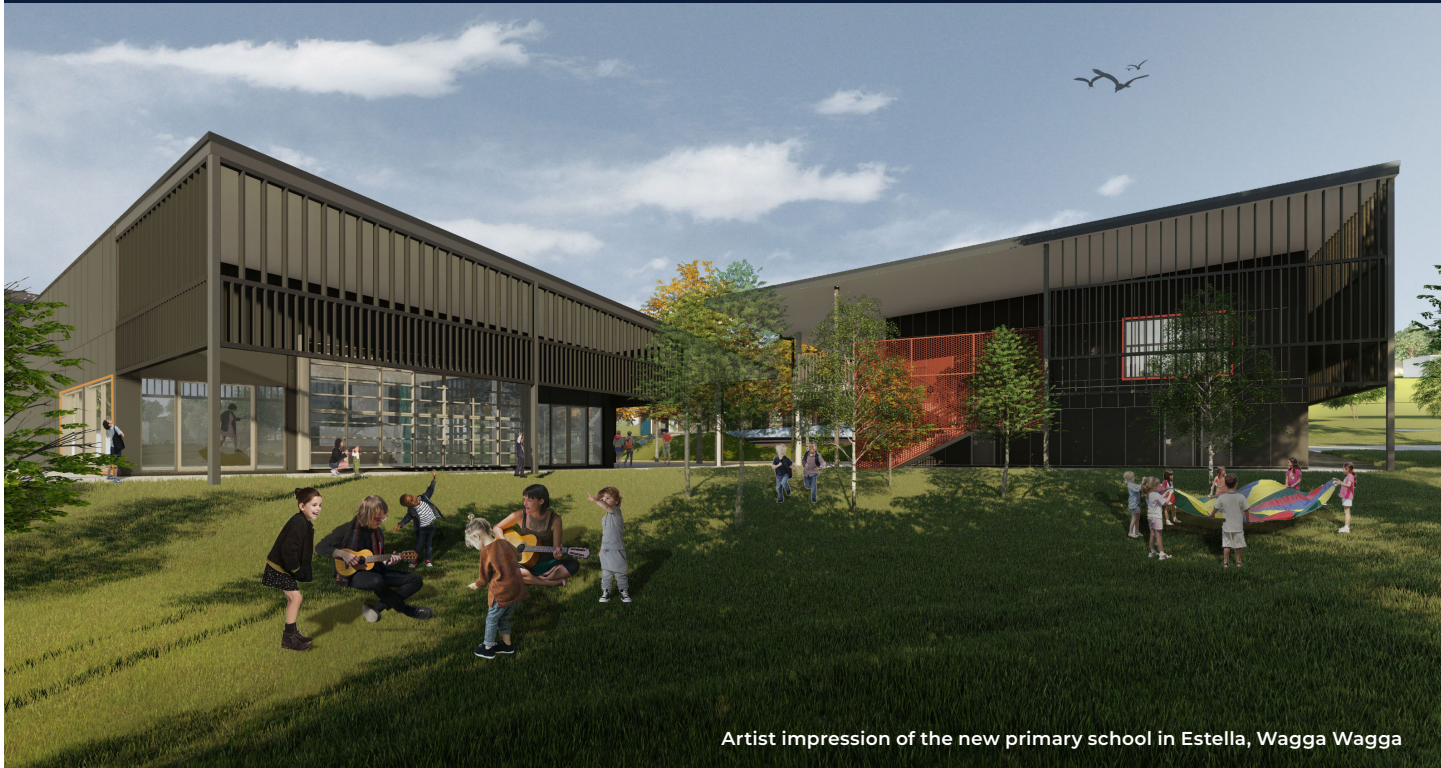
Artist impression of the new primary school in Estella, Wagga Wagga

The new primary school in Estella, Wagga Wagga, is designed to accommodate up to 480 students from years K-6. The site for the new school will be integrated with the Charles Sturt University campus. The school will have: