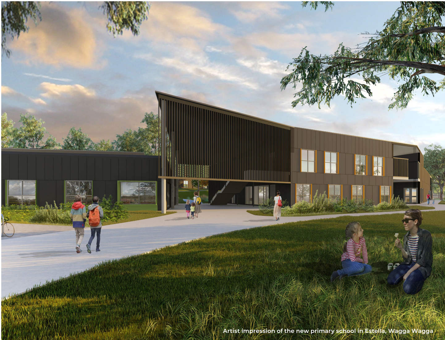
Artist impression of the new primary school in Estella, Wagga Wagga