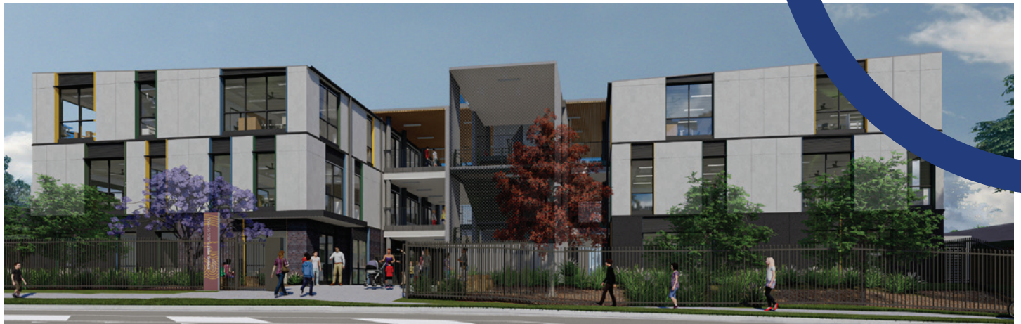
Artist impression of the Epping West Public School upgrade