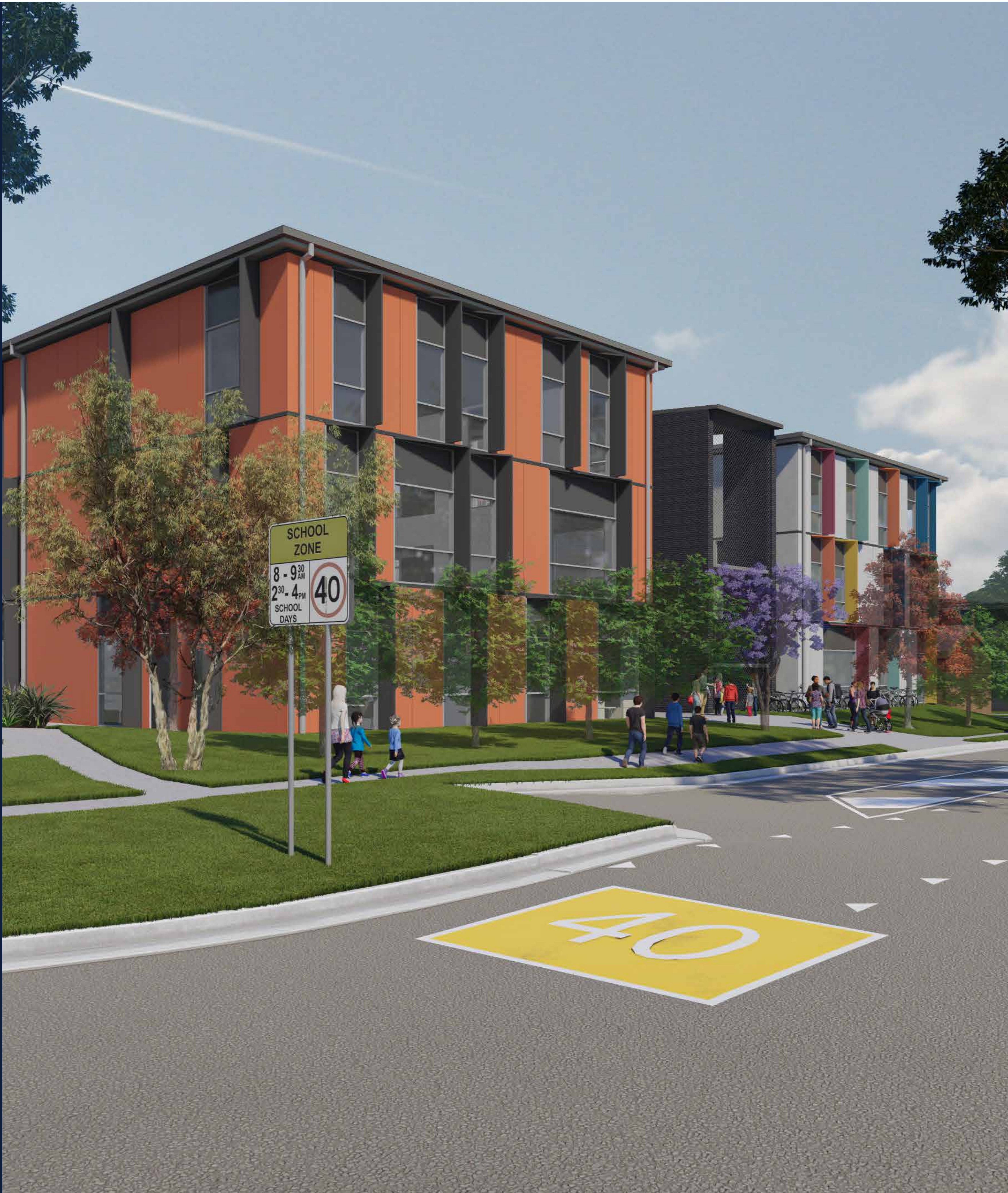
Artist impression of Epping West Public School