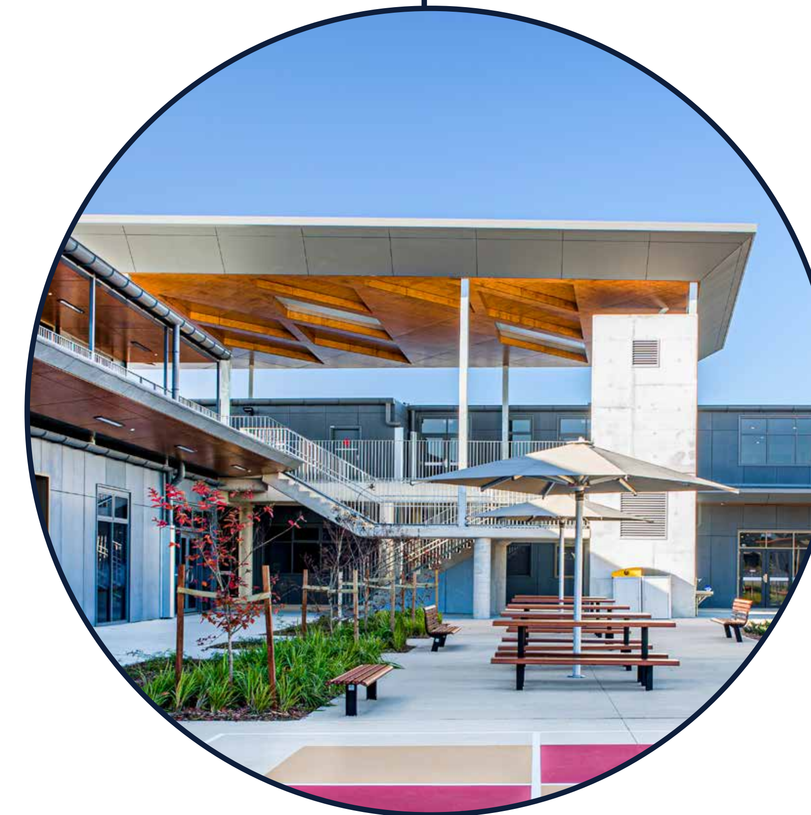
Indoor / outdoor learning spaces