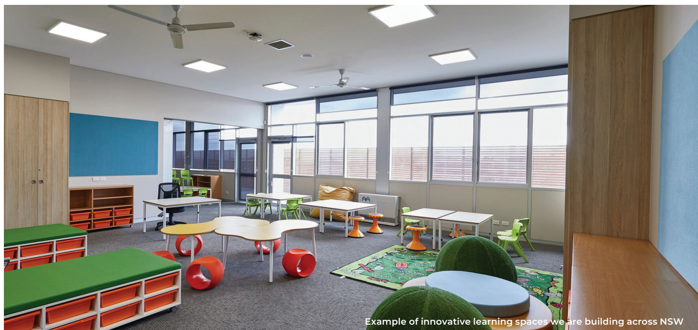
Example of innovative learning spaces we are building across NSW