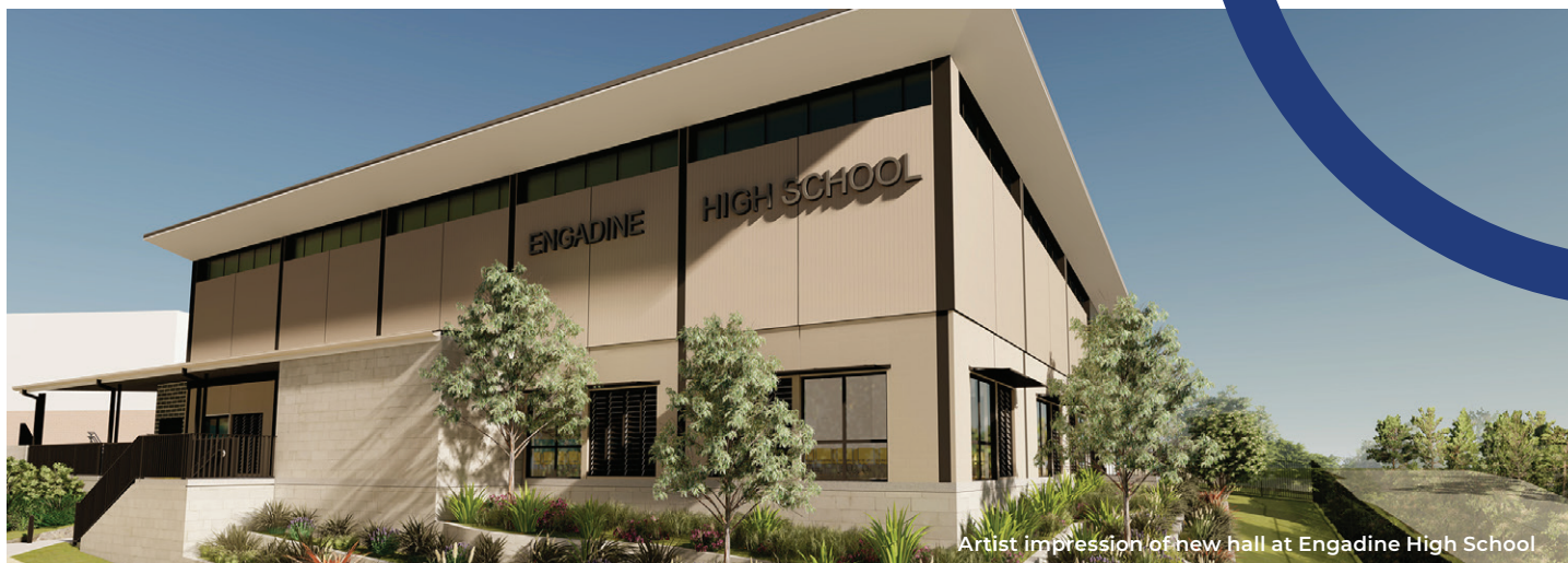
Artist impression of new hall at Engadine High School