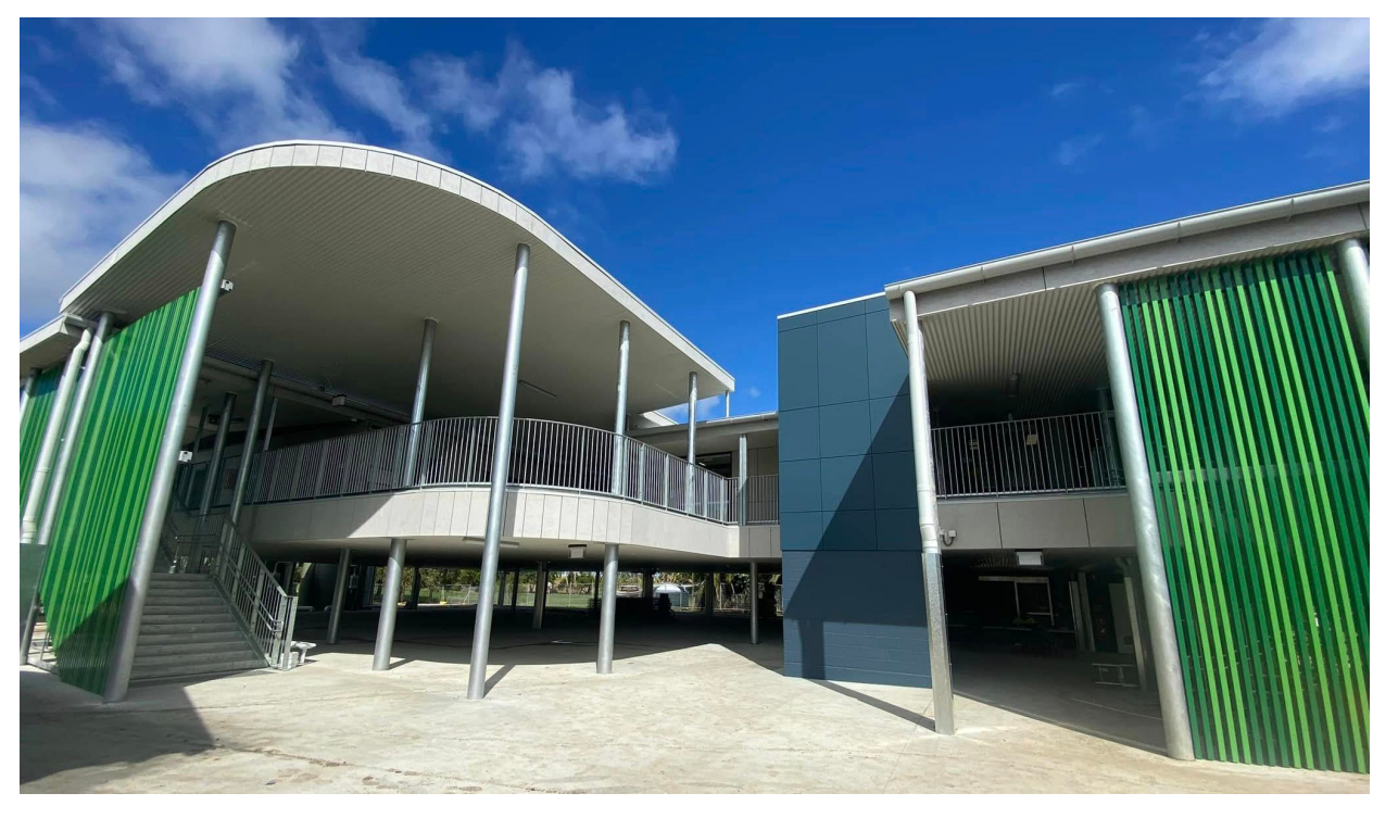
The outside of the school is looking great

There has been a lot happening at the new school over the past few months.