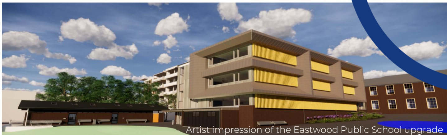
Artist impression of the Eastwood Public School upgrade