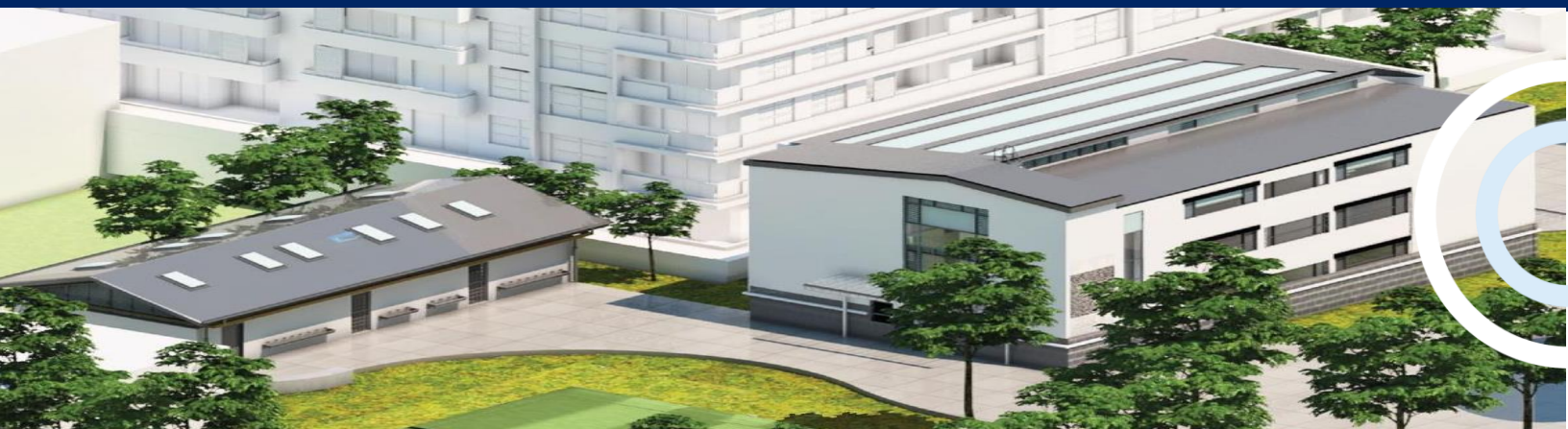
Artist impression of the Eastwood Public School upgrade