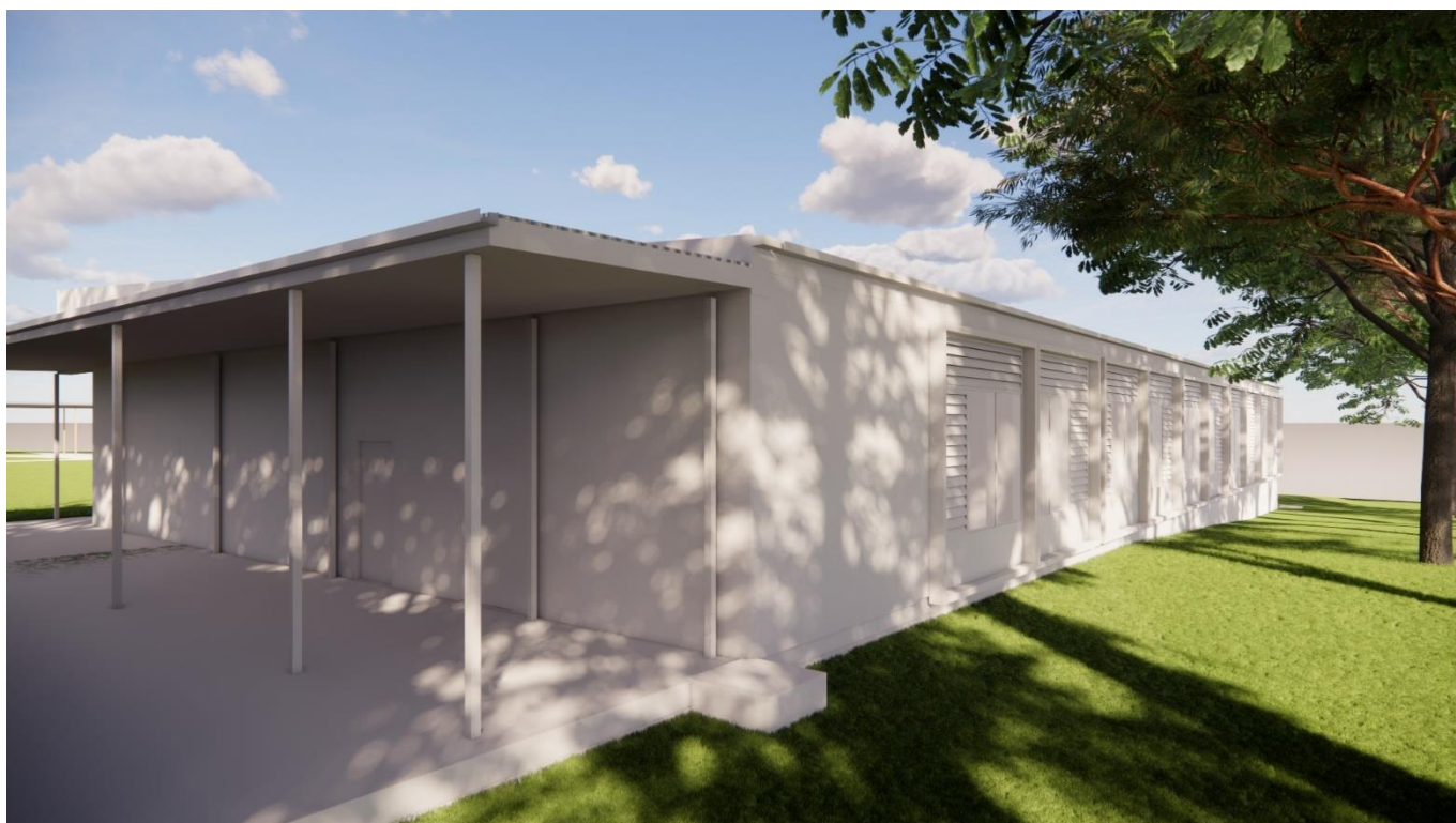
Indicative design of amenities connected to the new building (subject to change)