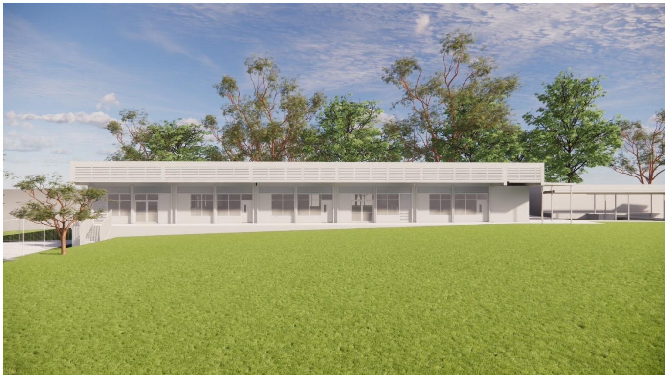
Indicative design of the new classroom building (subject to change)