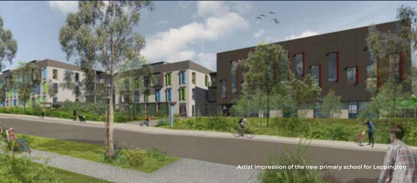
Artist impression of the new primary school for Leppington

The NSW Government is investing $6.7 billion over four years to deliver more than 190 new and upgraded schools to support communities across NSW. This is the largest investment in public education infrastructure in the history of NSW.