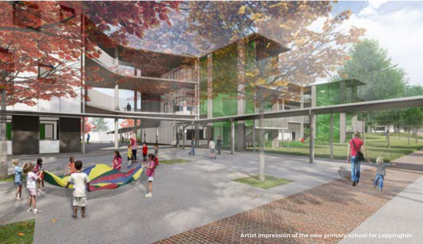
Artist impression of the new primary school for Leppington