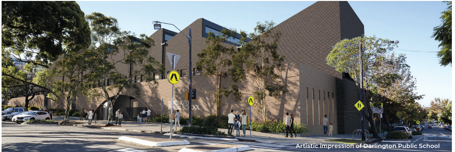
Artistic Impression of Darlington Public School