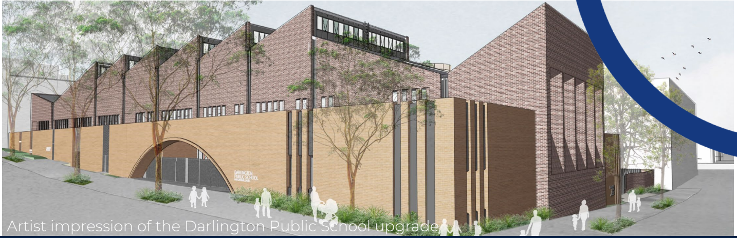
Artist impression of the Darlington Public School upgrade