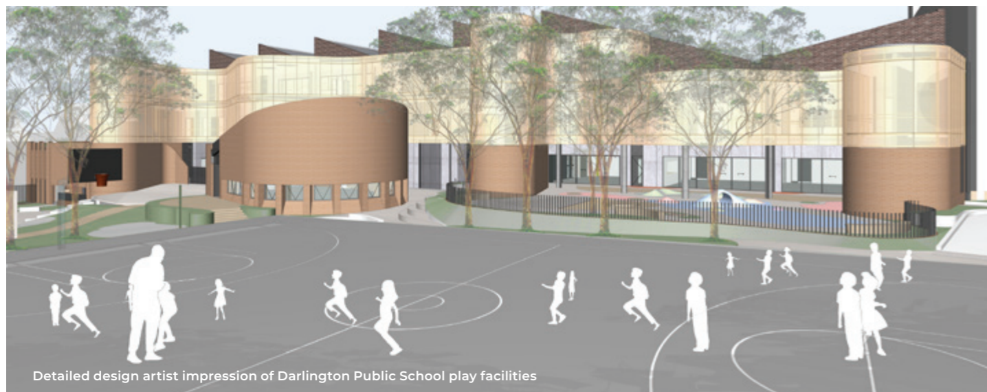
Detailed design artist impression of Darlington Public School play facilities

Over the coming months, work will continue to construct the new school building. This includes concrete pours, installation of scaffolding and completing structural elements of the new school building.