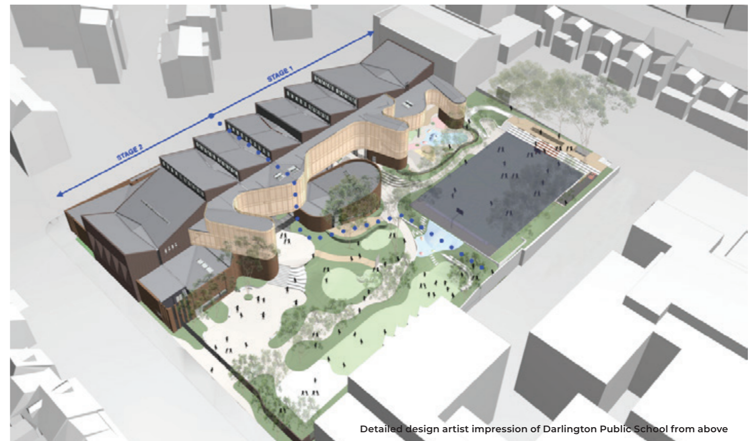
Detailed design artist impression of Darlington Public School from above

At the start of the next phase of construction, the school will move into the newly completed Stage 1 building.