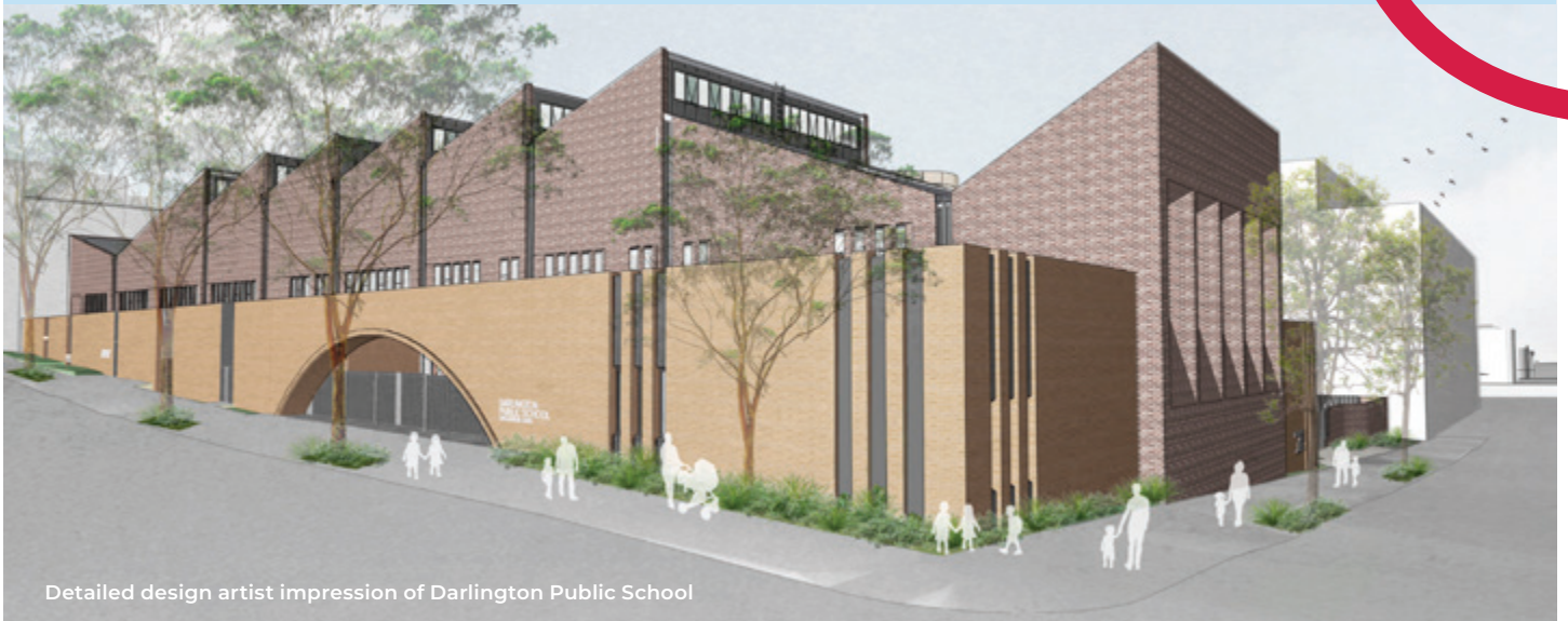
Detailed design artist impression of Darlington Public School

Darlington Public School is being upgraded to deliver new facilities and provide for growing student enrolments in the area. These new facilities will include: