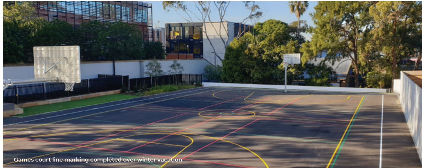
Games court line marking completed over winter vacation

Ground disturbance activities are now complete in the area that forms stage 1 of construction. The area has been remediated in accordance with the Main Works Asbestos Management Plan, the Remediation Action Plan, the Department of Education's Asbestos Management Plan and SafeWork NSW regulations.