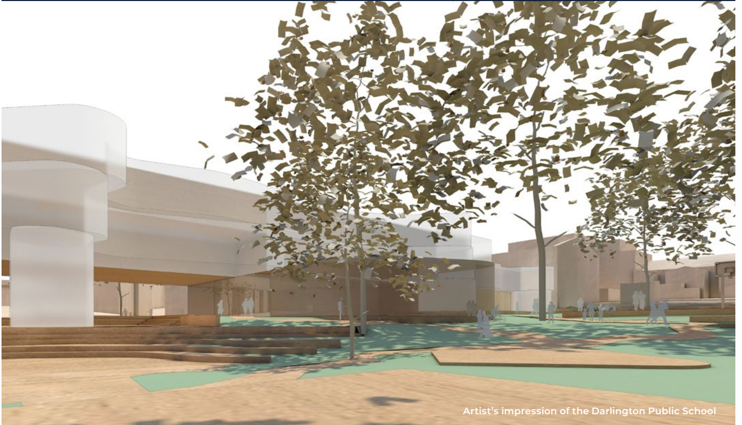
Artist's impression of the Darlington Public School

The NSW Government is investing $6.7 billion over the next four years to deliver 190 new and upgraded schools to support communities across NSW. In addition, a record $1.3 billion is being spent on school maintenance over five years. This is the largest investment in public education infrastructure in the history of NSW.