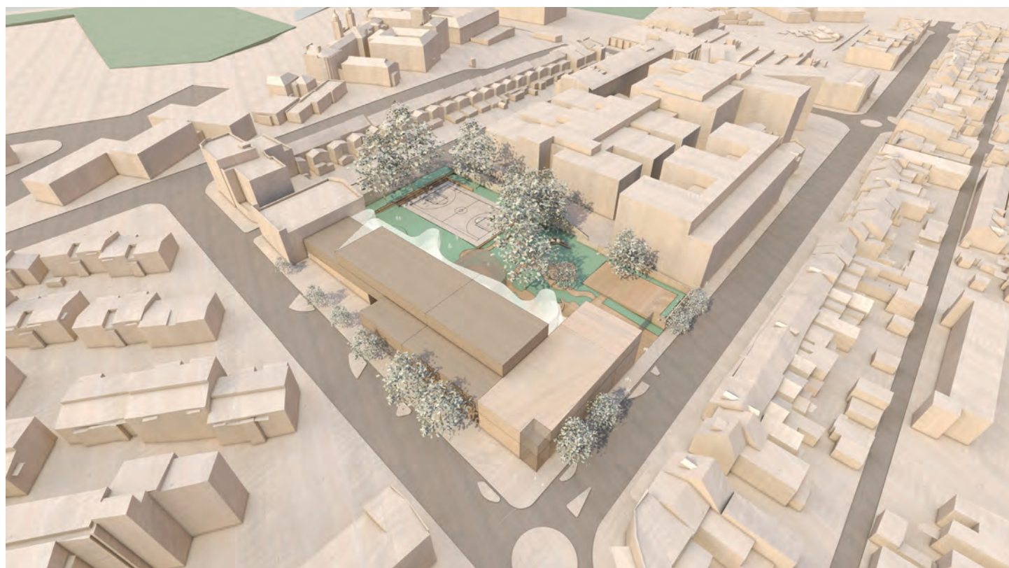
Early artist's impression of Darlington Public School upgrade