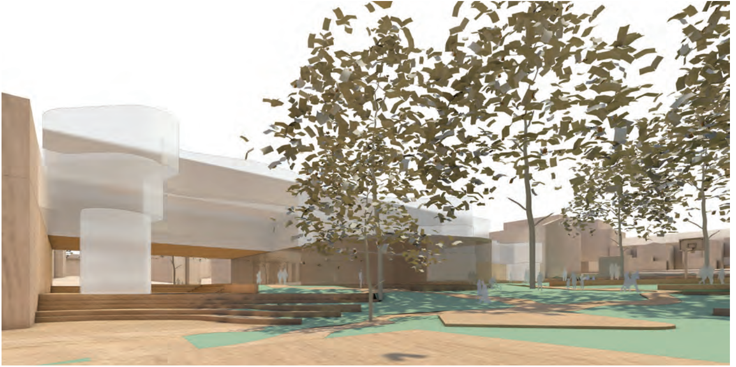
Early artist's impression of Darlington Public School upgrade