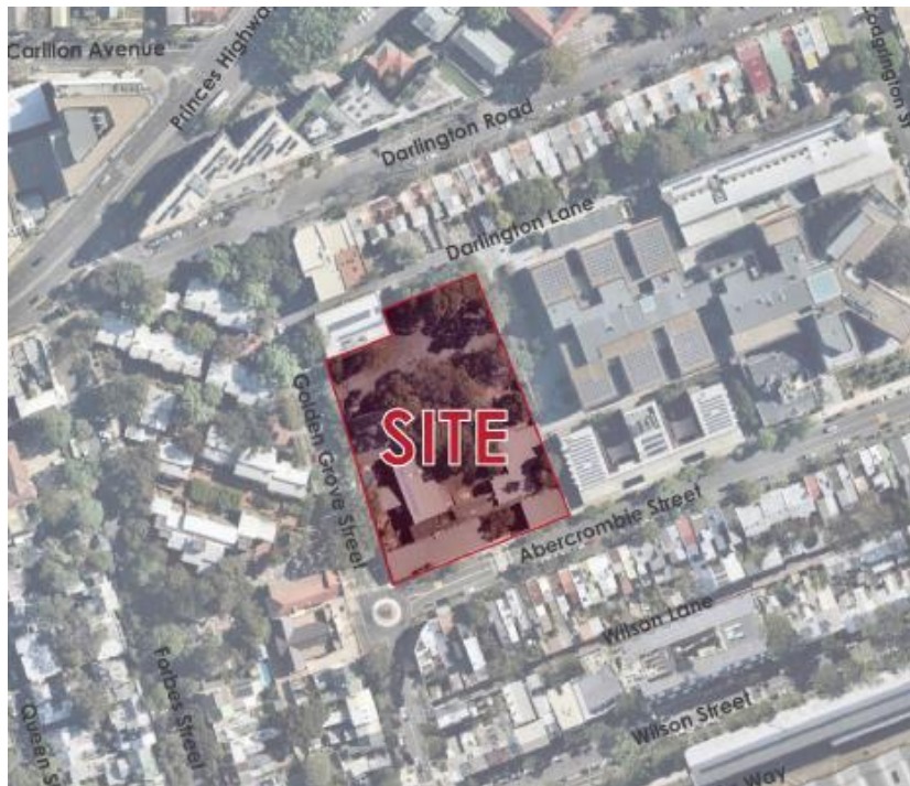
Figure 1: Darlington Public School site

The project site is located at the corner of Golden Grove Street and Abercrombie Street, Darlington. The site address is 417-445 Abercrombie Street, Darlington.