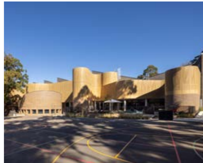
The new sports court was delivered as part of Stage 1