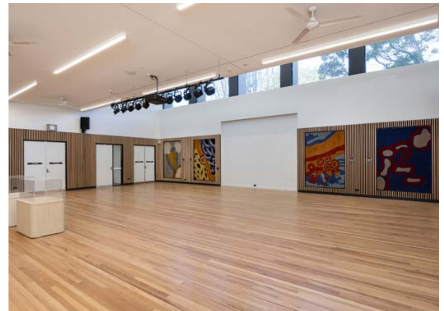
The new hall includes a permanent installation of rugs from the school's Aboriginal art collection

The school's large collection of Aboriginal art, both movable as an essential part of the fabric of the school, creates a setting which envelops the teachers and students in Aboriginal traditions and teaching. This aesthetic underpins the teaching methods, creating unique spaces with both social and functional use.