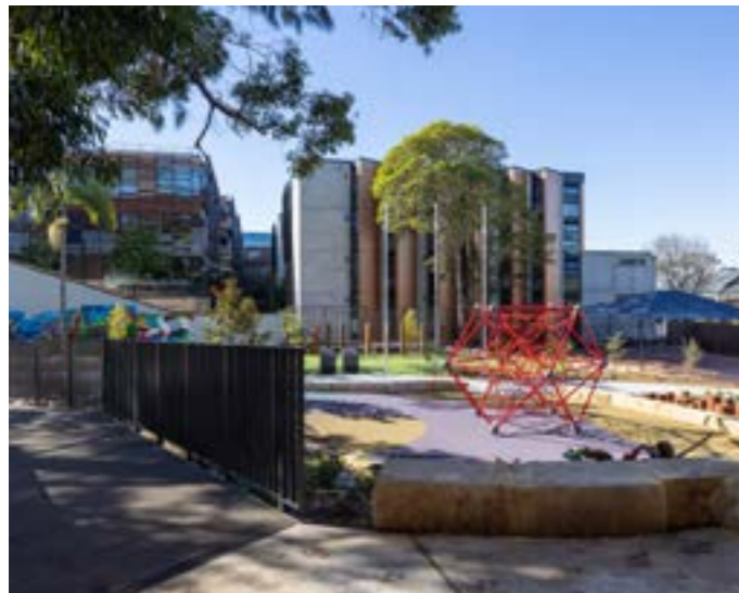
Outdoor play area