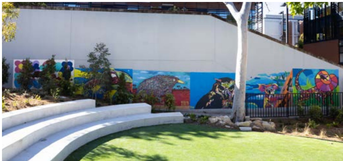
The Year 6 art was established in 2015

Key murals, such as the Year 6 art wall, were retained. Space is provided for future expansion of these artworks, which is an important consideration for current and future students who see it as an opportunity to create their own artwork for the school.