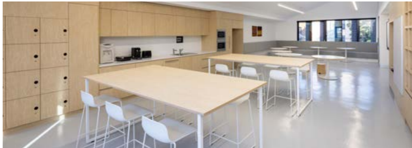
New staff facilities