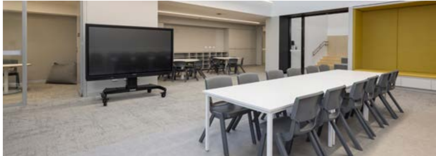
Learning space on Level 2

As part of the project, existing murals have been selected by the artwork committee to be printed and installed internally within the school classrooms.