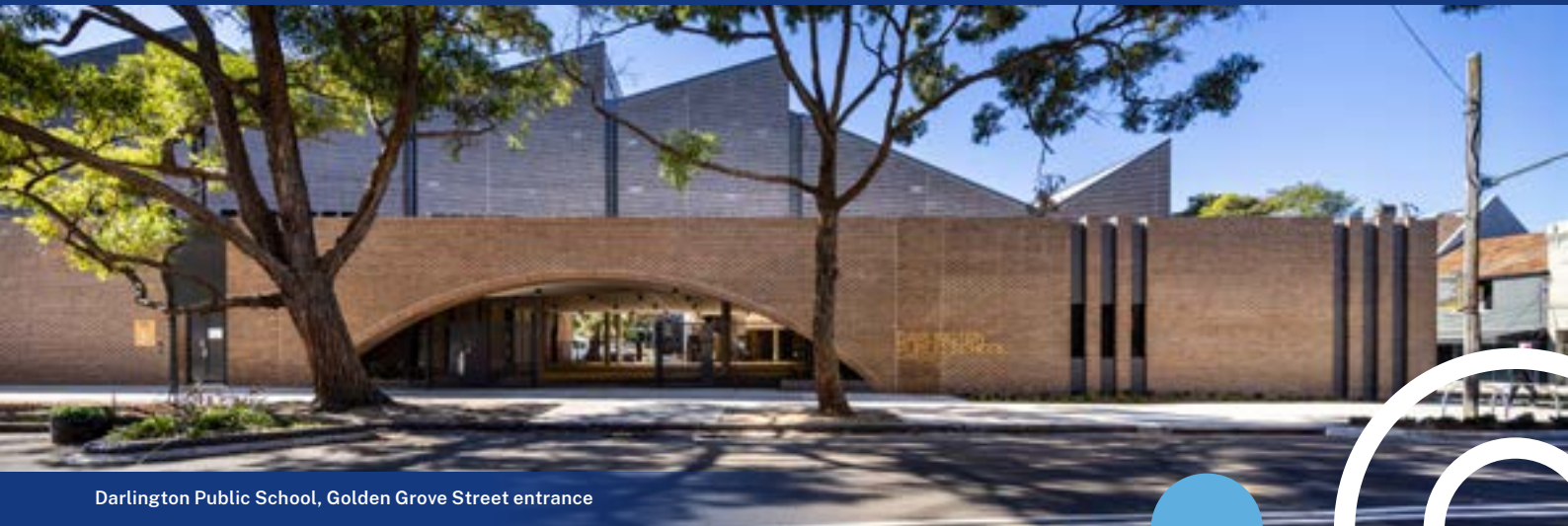
Darlington Public School, Golden Grove Street entrance