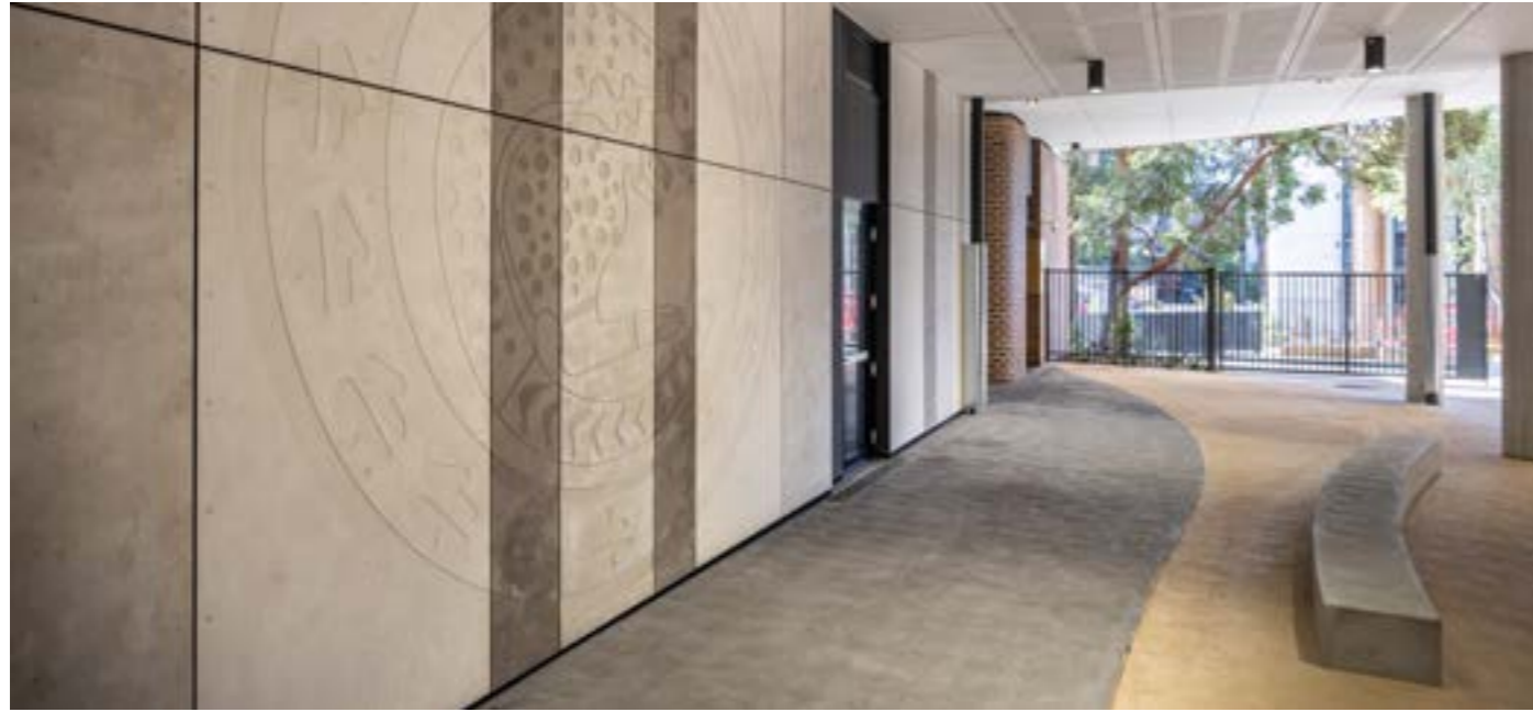
The COLA integrates Aboriginal art on the wall outside the Reception area

The consideration of Aboriginal cultural heritage was a key part of the design of the school upgrade, ensuring Aboriginal cultural heritage was incorporated into the design, focusing on key spaces such as the entry undercroft, school hall, library, classrooms and playground. The design acknowledges that the artwork, murals and objects are integral to the school's identity.