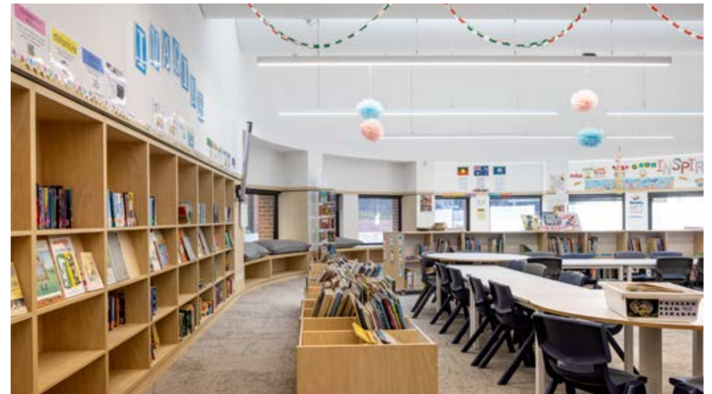
The school has been enjoying the new library, which was delivered in Stage 1

The consideration of Aboriginal cultural heritage was a key part of the design of the school upgrade, ensuring Aboriginal cultural heritage was incorporated into the design, focusing on key spaces such as the entry undercroft, school hall, library, classrooms and playground. The design acknowledges that the artwork, murals and objects are integral to the school's identity.