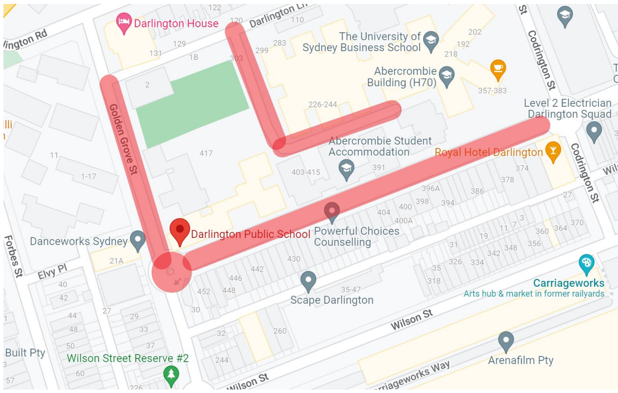
Figure 1: Map of Stage 2 construction works notification distribution area

The below details the nearest sensitive receivers that may be impacted by construction including noise. These stakeholders will receive notifications for unplanned out of hours works before undertaking the activities or as soon as is practical afterwards. This will also consider residents that may be impacted by heavy vehicle movements and other non site specific impacts (e.g. truck movements).