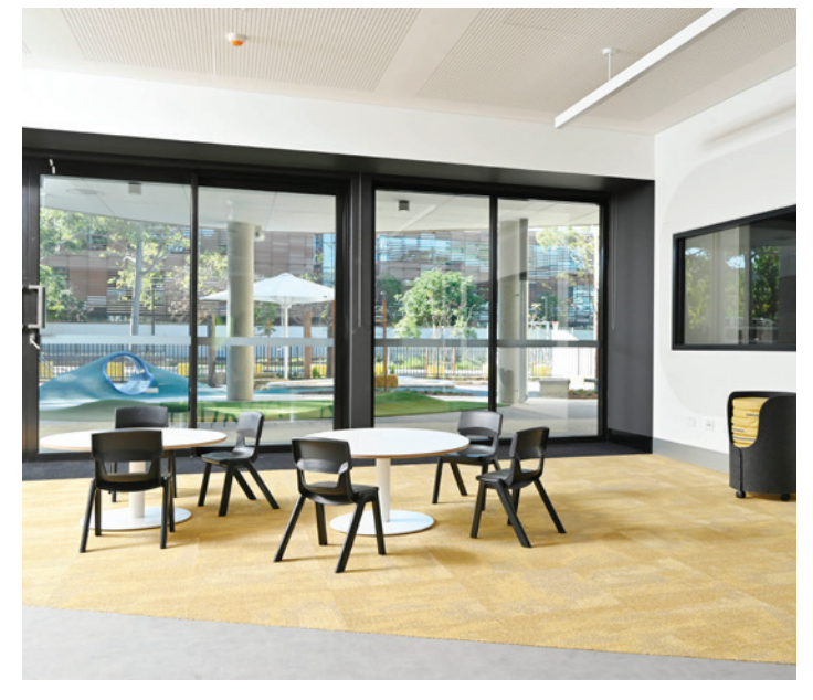
Collaboration space - Level 1