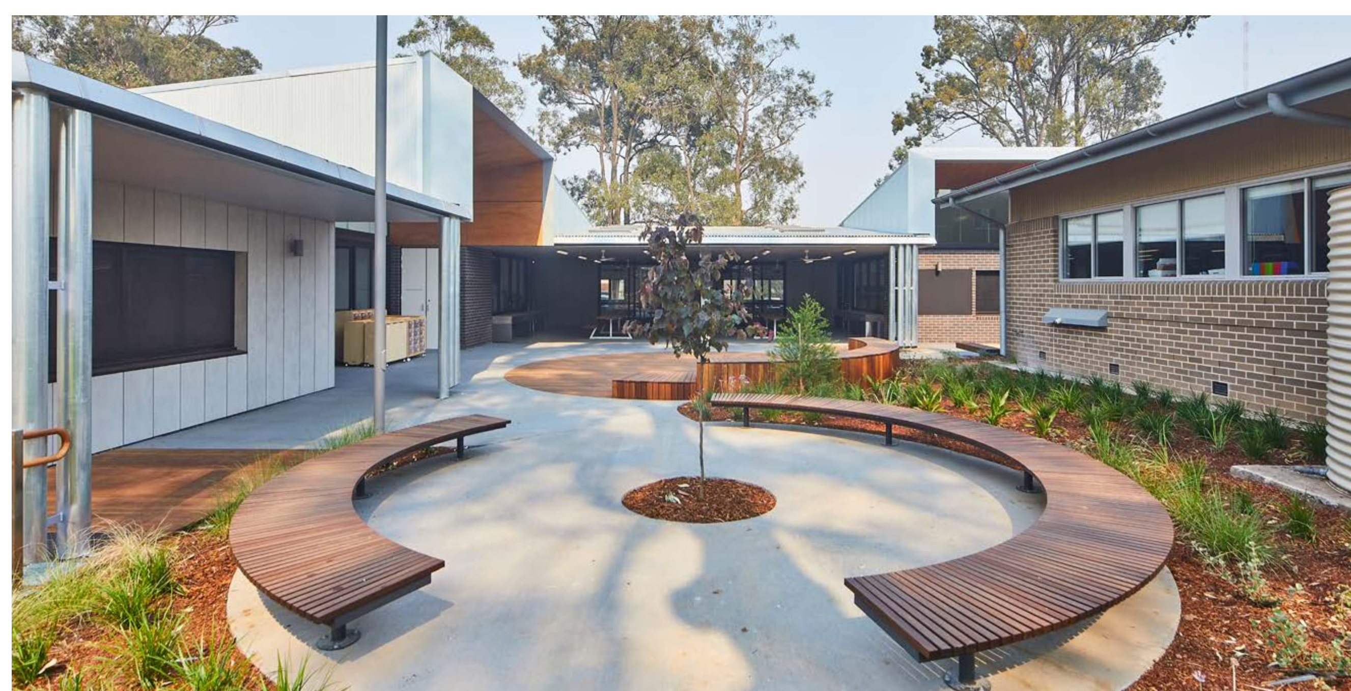
Prestons Public School