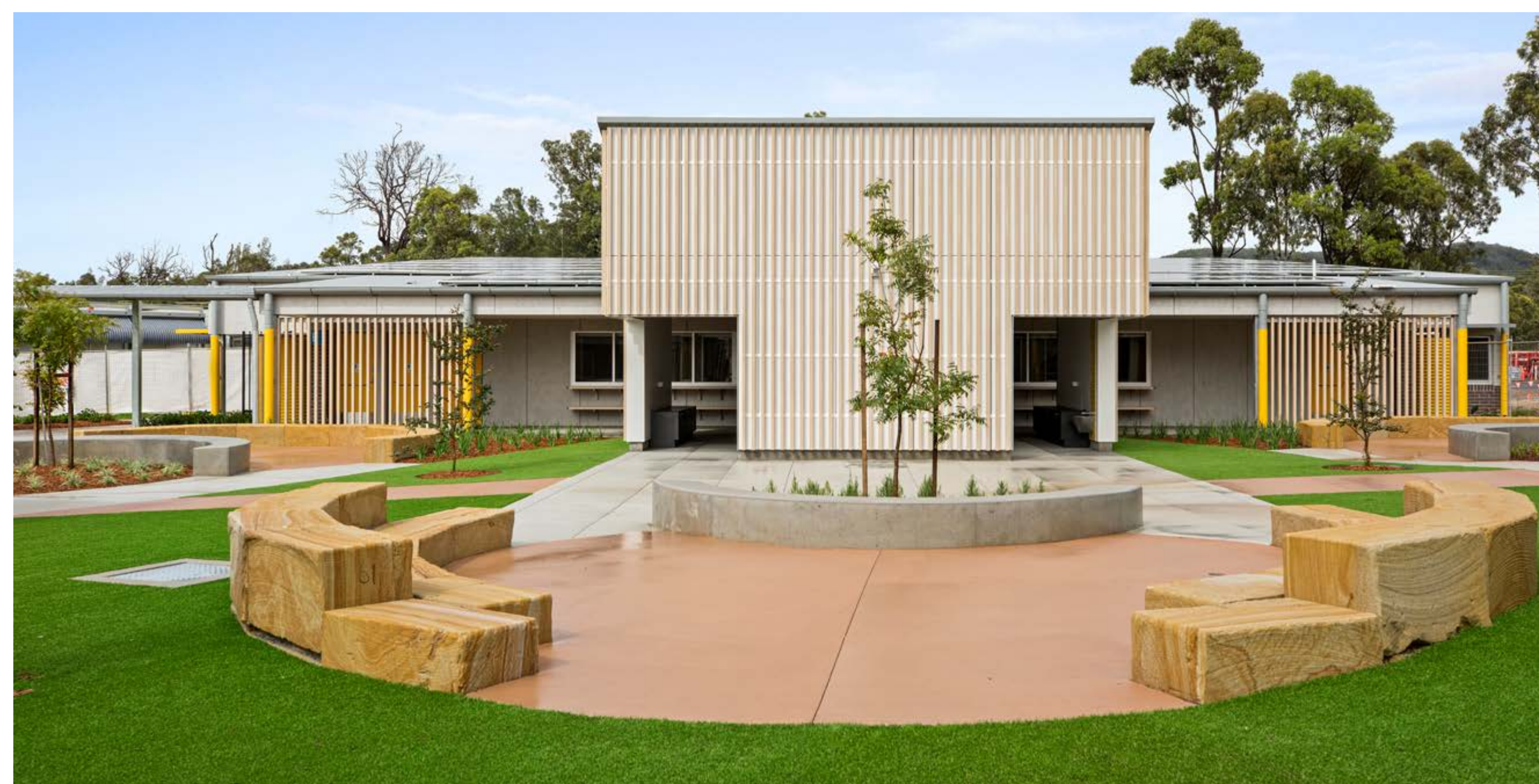
Lake Cathie Public School

The images below are examples of outdoor spaces from recently completed new and upgraded schools.