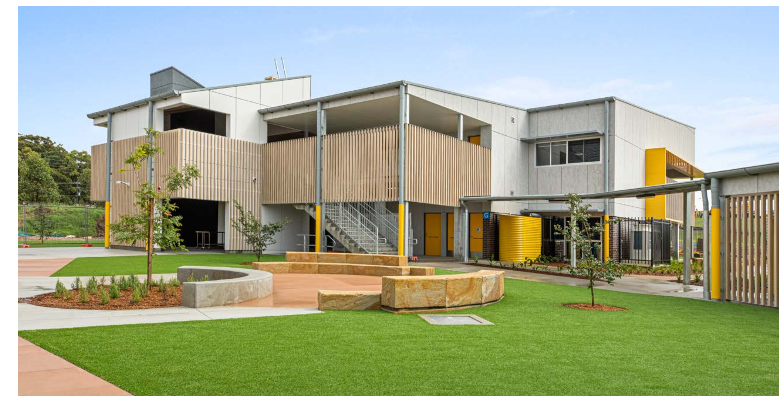
Lake Cathie Public School