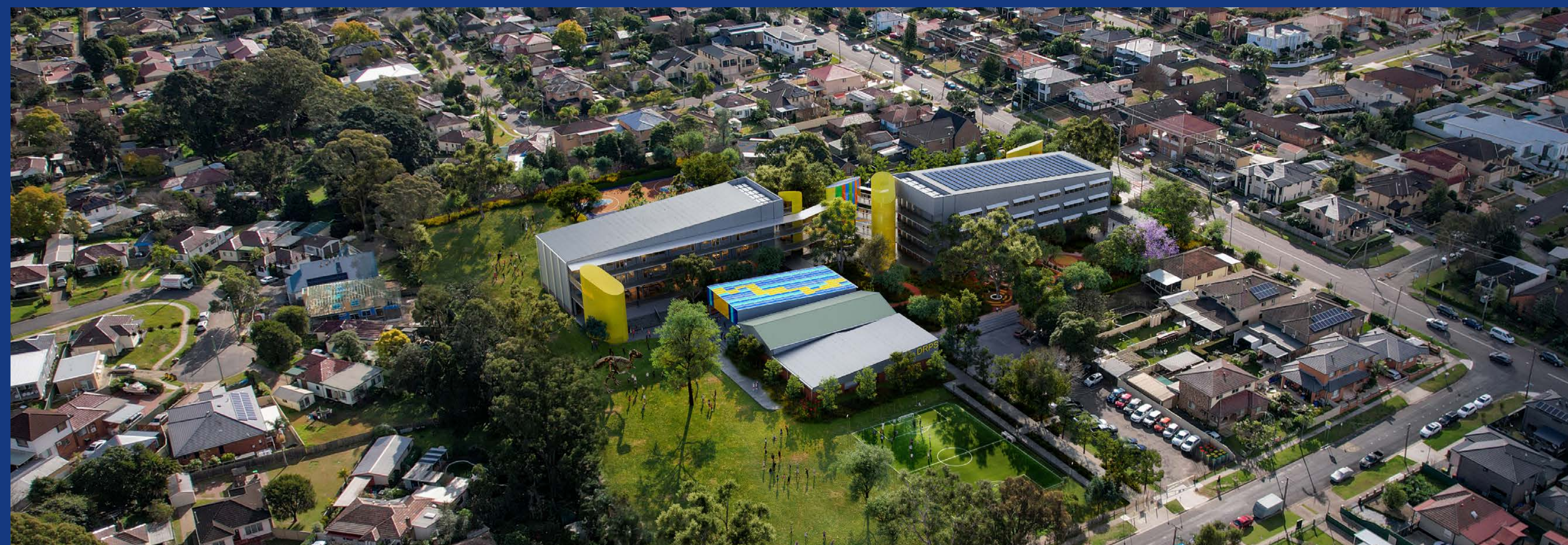
Artist impression showing an aerial view of the new school buildings