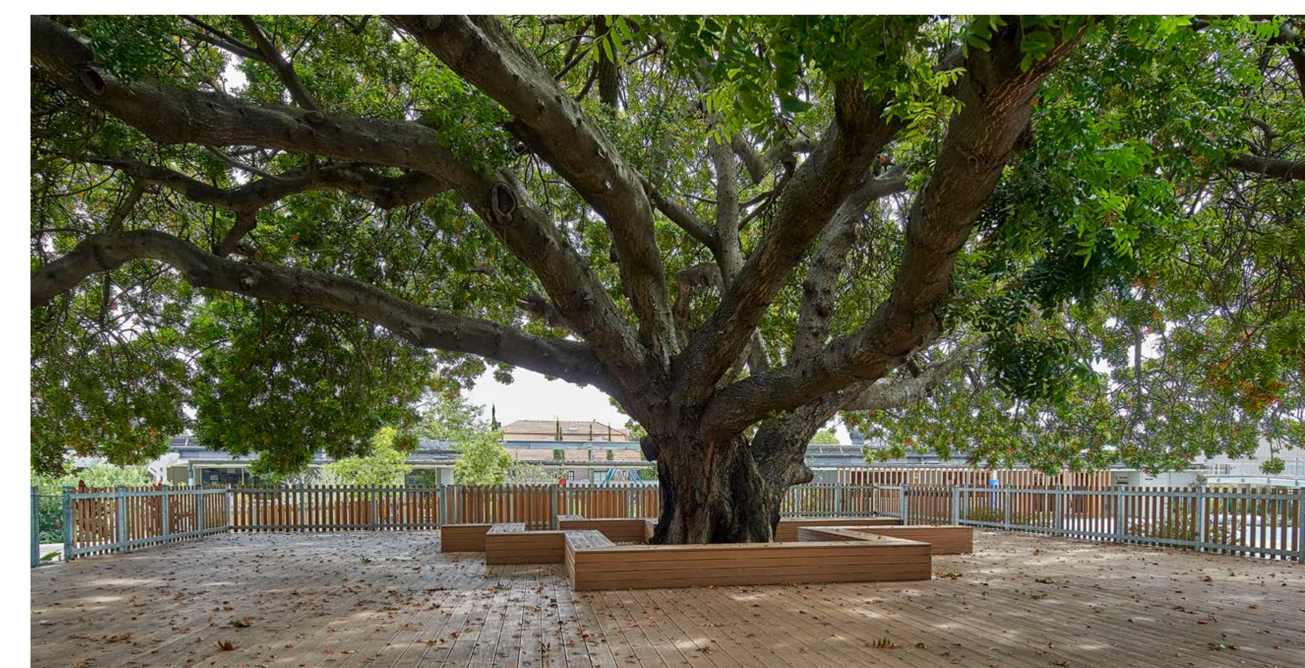
Lucas Gardens School