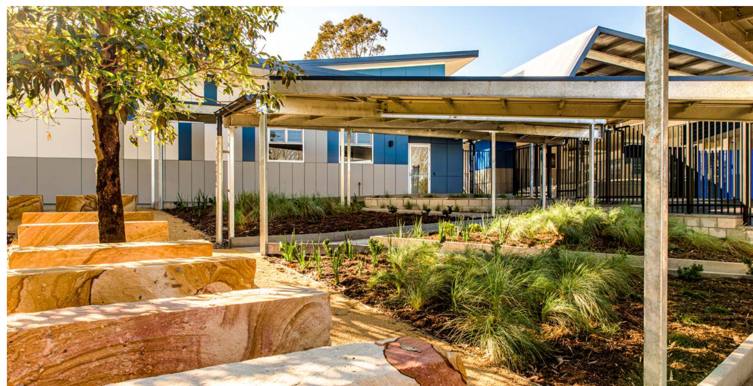
Speers Point Public School