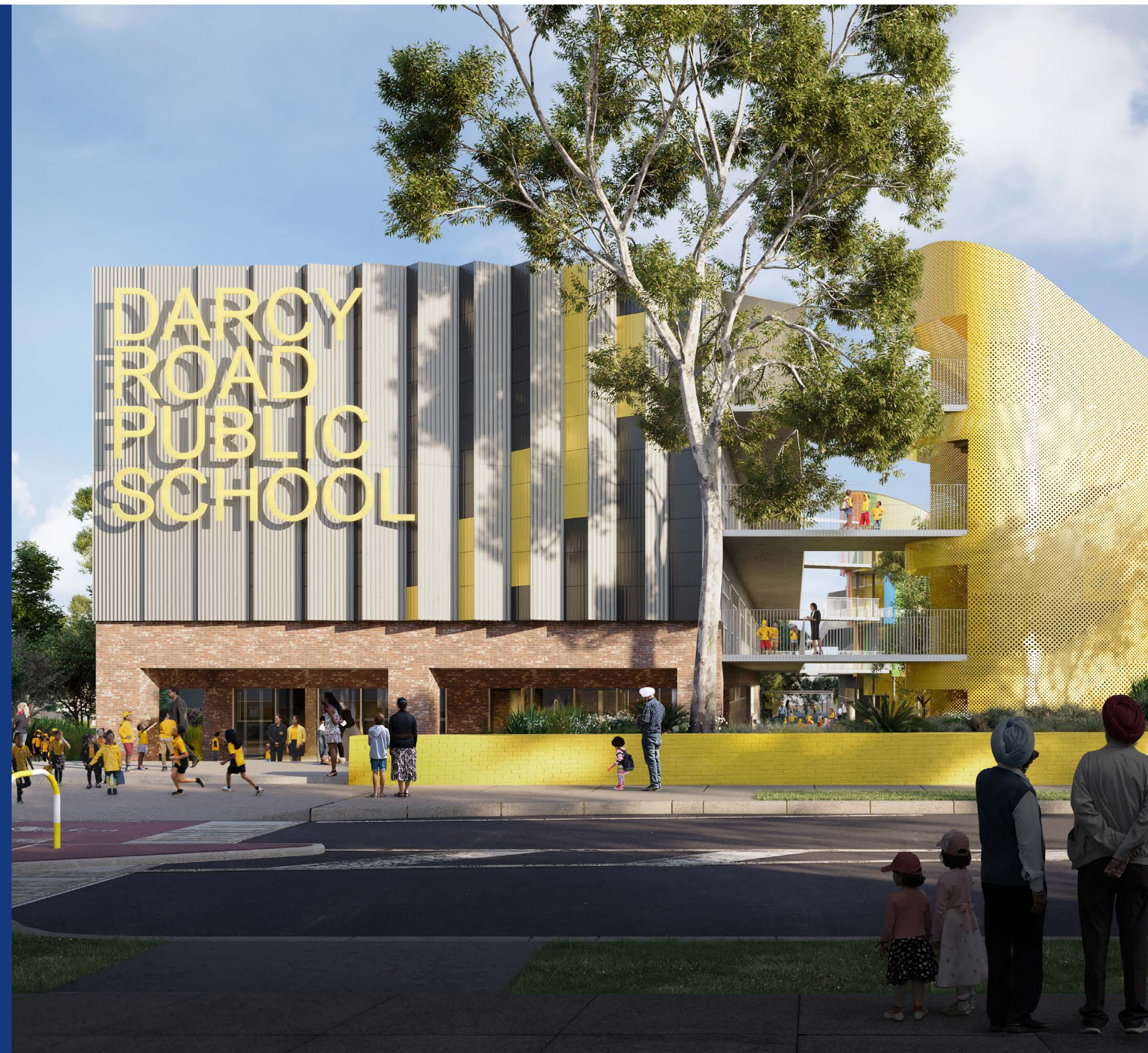
Artist impression of the new entrance to Darcy Road Public School (subject to change)